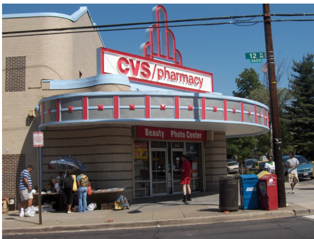
Adaptive reuse of an historic building