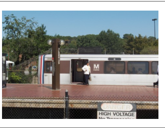
Brookland /CUA Metro Station

The Brookland/CUA Small Area Plan conveys a shared vision for the neighborhood as articulated in these Guiding Principles. As areas of the city grow, underutilized land, especially at and near Metro Stations, is under pressure for redevelopment. This Plan serves as a framework for guiding that future growth.