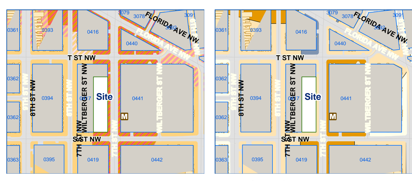
Future Land Use Map