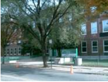
Carver Elementary School

1930. The oldest section of the building was the north block, which was razed in 1969 and replaced with a new structure. Snowden Ashford (1866-1927), who was most proud of his work designing, maintaining and inspecting DC schools, served as one of the architects.