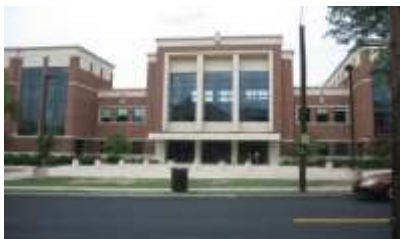
New Kelly Miller