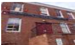
Grades 9-12 12 th St. SE