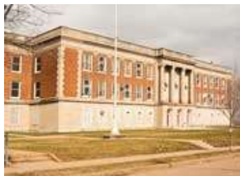
Eliot-Hine Middle School

School, in 1932, for white students. In 1952, black parents boycotted the use of nearby annexes as schools for their children instead of the construction of new buildings or the transfer of low-population white schools to the black division. In 2008, Eliot Junior High School and Hine Junior High School, 1830 Constitution