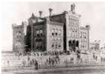
Hine Junior High School

The Hine Junior High School's original location was 335 8 th Street SE. The original site was the former Eastern High School, built in 1892, and Towers Elementary School, built in 1887. Those schools joined to become Hine Junior High