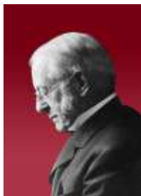
Charles W. Eliot