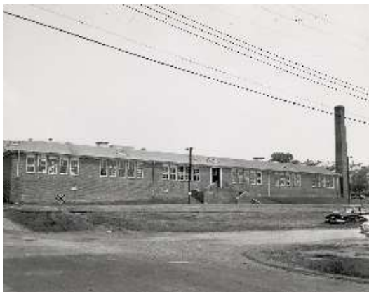
Former Merritt Elementary School