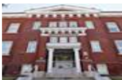
Grades 6-9 Kenyon St. NW