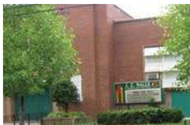
Old Nalle Elementary School