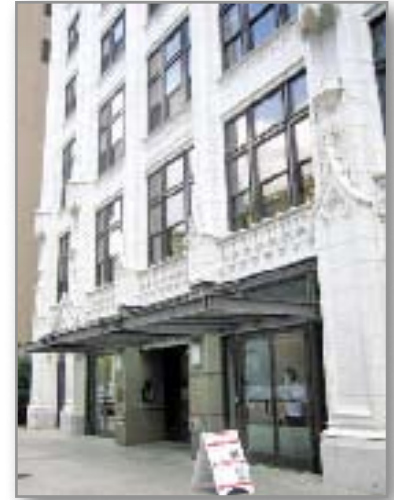
The Mather Building in downtown DC is an example of an affordable live-work space for artists. The building had been vacant for over a decade before the Cultural Development Corporation of DC and a private developer renovated it as condos, with the units on the building's second two floors designated for artist live/work space. This development gave artists an opportunity to own their space at a very low cost and enabled them to remain in the District.

See also the Housing Element for additional policies and actions on affordable and workforce housing.