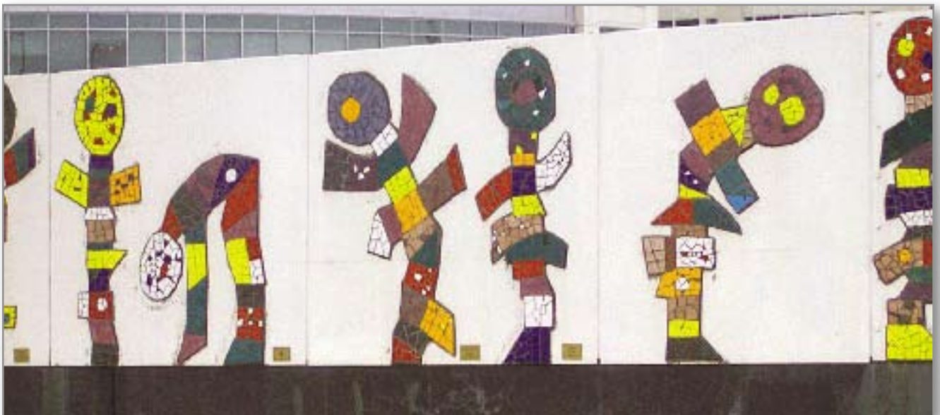
H Street overpass, a.k.a., the "Hopscotch Bridge"

Conduct a feasibility study on re-establishing a City Museum with public and private support to serve as a showcase of District art, culture, and history, including archival records for the District of Columbia. The study