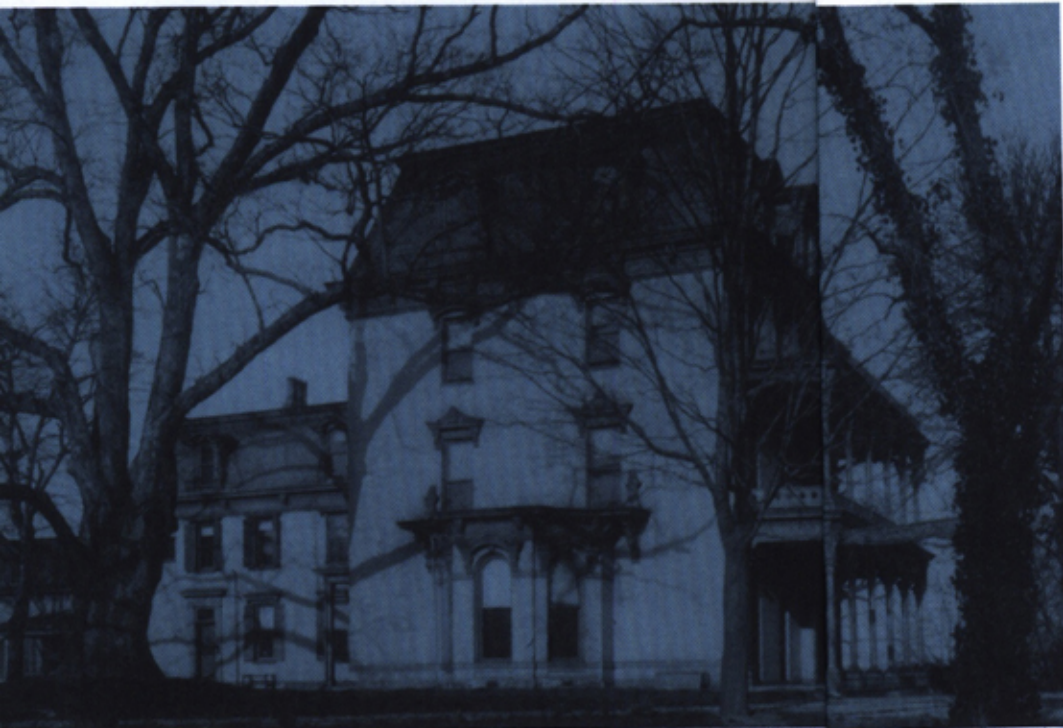
Oak Lawn, circa 1873 (identified as "Willard's" on the inside cover), occupied the site of the present-day Hilton Hotel. Originally built circa 1820, Oak Lawn was remodeled in 1873 into this extravagant four-story, Second Empire-style house. Long a Washington landmark, the building was razed in 1952; a year later, its celebrated 400 year-old "Treaty Oak," reputed to have been the site in the late 17th century of several treaties between the first English settlers in the area and the local Indian tribes, was also leveled by developers.

Just beyond the district on the outside edge of the city, a large estate known as Widow's Mite in the early 19th century, and later as Oak Lawn, commanded the higher elevation of the area and enjoyed majestic views of the nascent city. Below Oak Lawn was Holmead's Burying Ground (or, Western Burial Ground), established by the city in 1798 as one of two public cemeteries. Holmead's operated as a cemetery until 1884, at which point the bodies were removed and the square sold by the City Commissioners for private development.