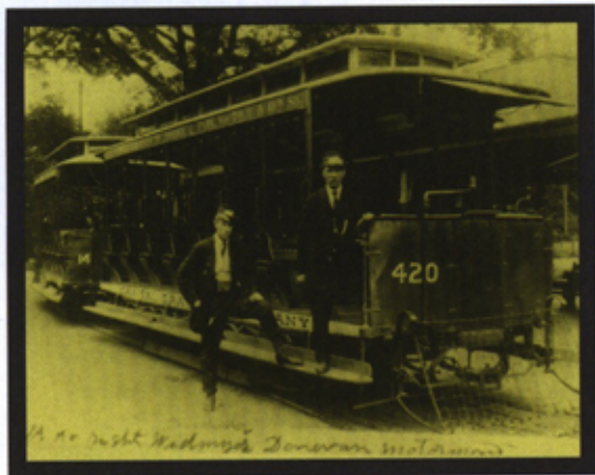
This streetcar ran from the Potomac River Steamboat wharves up 7th Street, NW, along U Street to 18th Street, NW, across Rock Creek on the Calvert Street bridge, and then north on Connecticut Avenue to the Zoological Park (National Zoo).