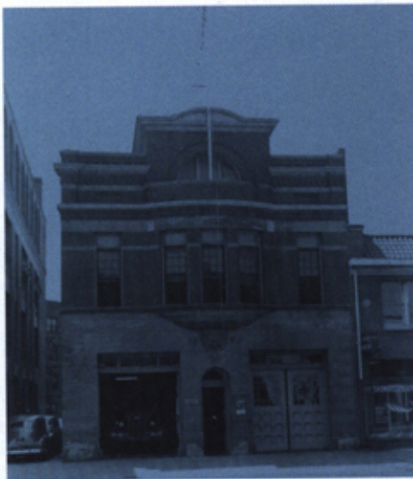
Engine Company #9, circa 1921. Built in 1893 at 1624 U Street, NW, this firehouse was recently renovated and converted into condominiums and offices.