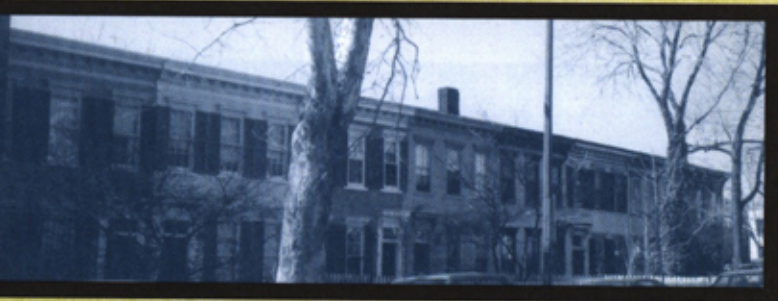
Current-day photo of 1700 block of T Street, built 1873-1874. This row of modest-sized Italianate-style dwellings, along with a group on Seaton Place, survive as the oldest buildings in the Strivers' Section Historic District.

These speculators, as a group, achieved almost instant success. They built over 150 houses in the two-year period between 1873 and 1875 and transformed the once rural and isolated territory into a viable residential community. The men responsible for this transformation were among hundreds of nameless others whose small-time speculation helped to shape the growth of the city.