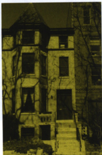
Current-day photo of 1733 T Street, NW, 1905.

On the few remaining contiguous lots in the area, builders erected small, three-story apartment buildings. Several larger, multi-storied apartment buildings were also constructed in the area, though generally on large and prominent corner lots that defined the district's edge.