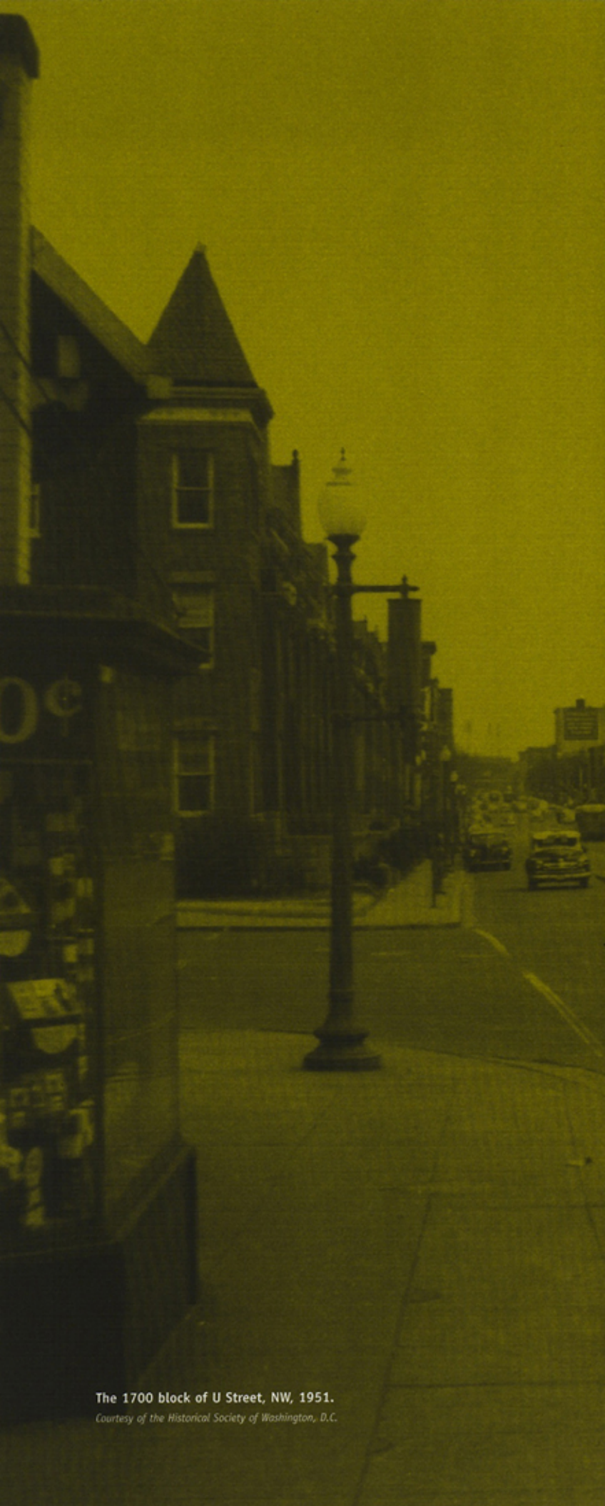
The 1700 block of U Street, NW, 1951.