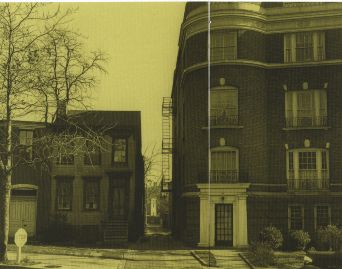
1901 and 1905 19th Street, NW, 1935. This historic photograph of a modest, 19th-century frame dwelling (left), next to a stylish Beaux Arts apartment building (constructed in 1917), clearly illustrates the diverse socio-economic composition of the Strivers' neighborhood in the 1910s and 1920s. In 1920, the U.S. Census indicates that the apartment building was home to two white Army officers and their families; the frame dwelling (demolished) was the residence of an African-American laborer and his family.