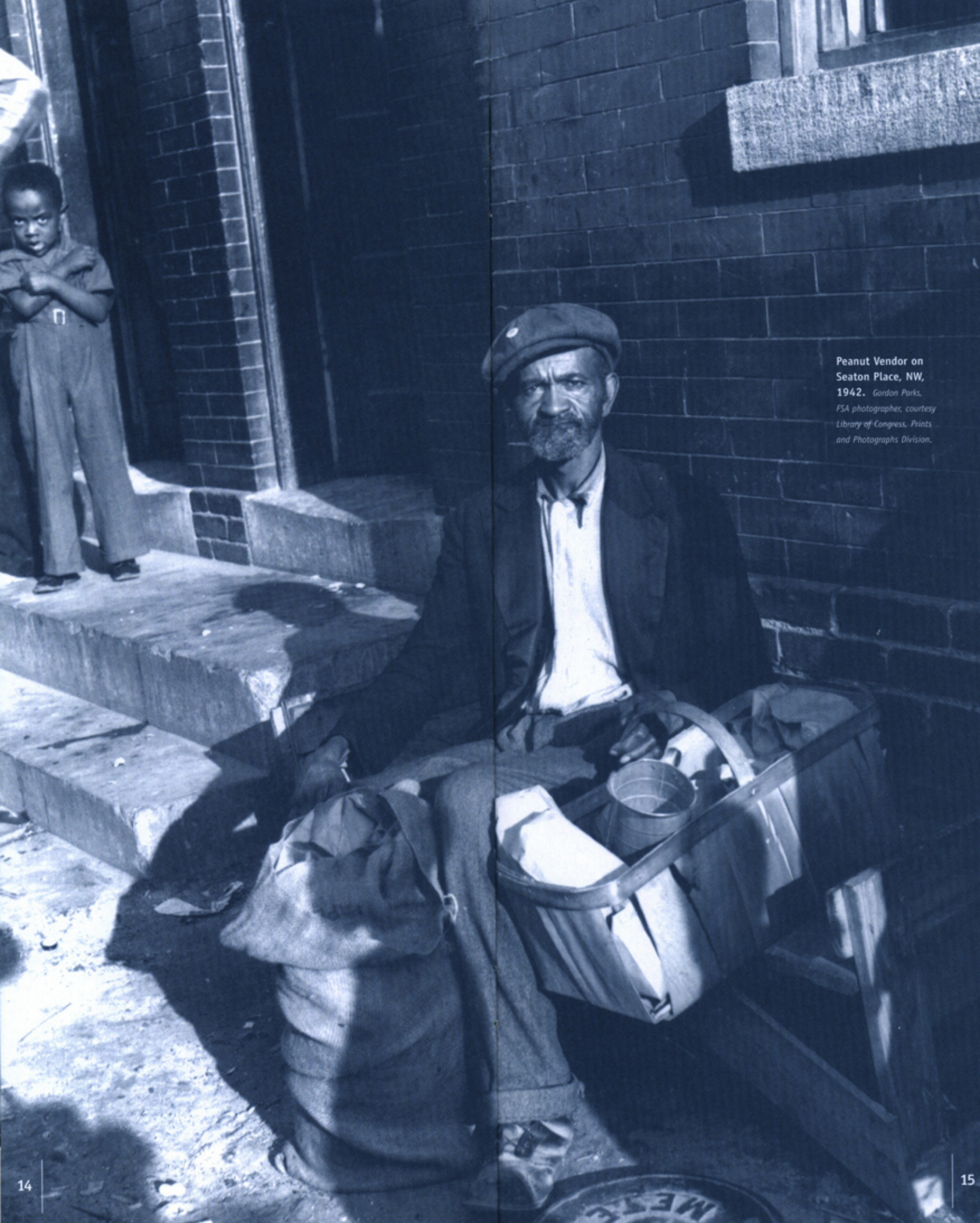
Peanut Vendor on Seaton Place, NW, 1942.