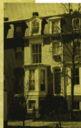
Current-day photo of Second Empire-style row at 17th and V Streets, NW built 1874-1875.