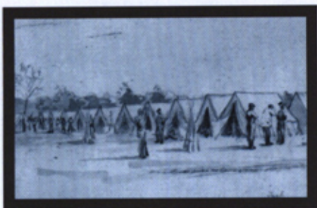
Camp of the 7th Regiment, New York, on 14th Street, 1861, near Strivers' Section.

Just beyond the district on the outside edge of the city, a large estate known as Widow's Mite in the early 19th century, and later as Oak Lawn, commanded the higher elevation of the area and enjoyed majestic views of the nascent city. Below Oak Lawn was Holmead's Burying Ground (or, Western Burial Ground), established by the city in 1798 as one of two public cemeteries. Holmead's operated as a cemetery until 1884, at which point the bodies were removed and the square sold by the City Commissioners for private development.