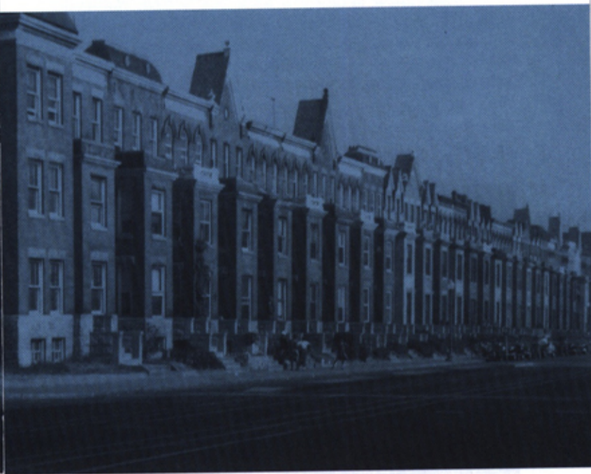
The 1700 block of U Street, NW, 1949. Constructed in 1902, this long row of houses on the north side of U Street was designed by architect Nicholas T. Haller, a prolific designer in D.C.

This section of the Rock Creek Railway line provided a direct link to the streetcar system's two north-south routes, along 7th and 14th Streets. Stimulated by the streetcar, and in spite of a temporary lull in development surrounding the Economic Panic of 1893, speculative development in the Strivers' Section boomed between 1893 and 1907. This boom not only created the long blocks of Queen Anne/Edwardian rowhouses that characterize the neighborhood today, but it also began to alter the socio-cultural composition of the area. What had been developing as a strong predominantly African-American community, was now open to middle-class white expansion. The same factors that encouraged African-American migration to the area—convenient transportation, changing settlement patterns provoked by increased population, the prospect of a new house and distance from the over-crowded downtown—also appealed to the city's white population.