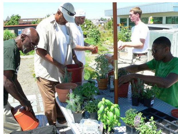
Urban Agriculture Example