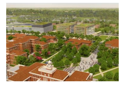
Implement a storm water management Pilot Program at St. Elizabeths East