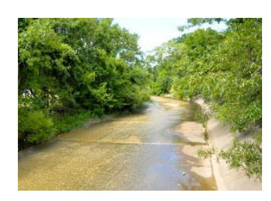
Restore Oxon Creek habitat and make trail improvements at Oxon Run Park