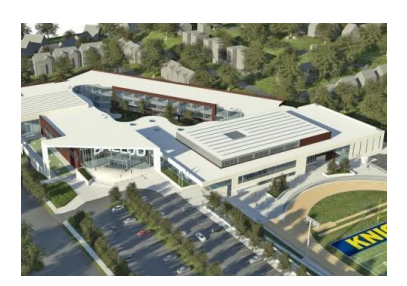
Pilot innovative energy projects and modernize Ballou High School