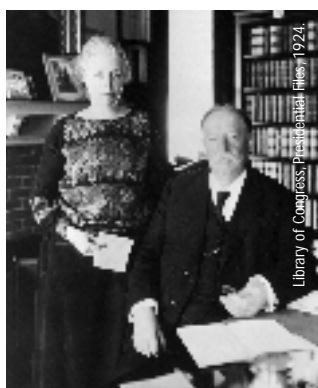
Mr. and Mrs. Taft