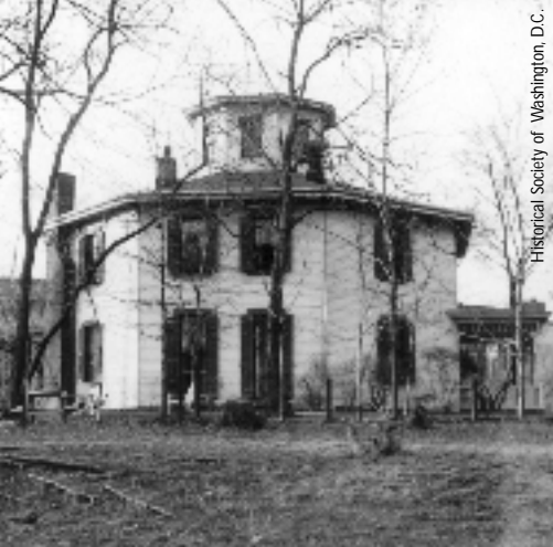
Historical Society of Washington, D.C.

"It was all country around here in 1900, Leroy Street wasn't paved, and at the top of the hill was the Old Phelp's Place, a big old frame octagon house that presided over the street, it made our street a dead end, which was very, very nice."