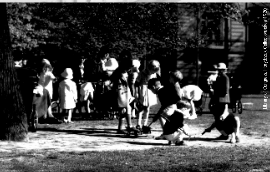
Library of Congress, Horydzak Collection, circa 1920

Margot Phillips, Wash. Star, Sept. 27, 1964