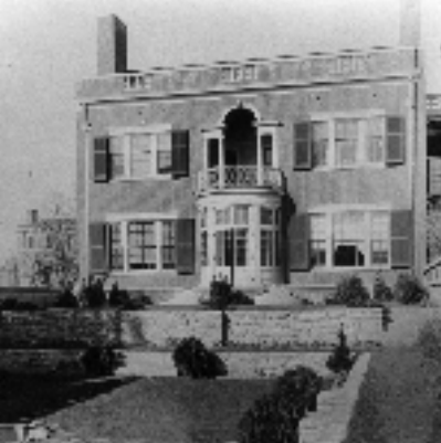
Woodrow Wilson House, 1916.

Served as former President William Howard Taft's home during his tenure as Chief Justice of the Supreme Court from 1921 until his death in 1930.