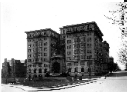
The Highland, circa 1910