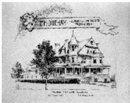
Illustration 22 and 23 Drawing and Photograph, 2129 Wyoming Ave. from Work of T. F. Schneider Architect, Washington, D.C., 1894

The higher elevation of the area occupied by Sheridan-Kalorama historically isolated it from the Federal City. Early topographical maps reveal that the land included hills, gentle knolls and the precipitous ravine of Rock Creek. After the sale of the original Kalorama estate in the late 19th century, there was substantial regrading of the land. Parts of the neighborhood were terraced to provide flat areas appropriate for more intense residential development, as well as to provide transitions between severe changes in grade. Despite these alterations, Sheridan-Kalorama still retains much of its unique character defined by the natural topography. The neighborhood is hilly, with tree-lined streets that are often short or contoured to meet the lay of the land. At its height, the area still affords an excellent view of the city. Both the historic and contemporary topography are atypical of the city and contribute to the identification of the Sheridan-Kalorama neighborhood as a distinctive place.