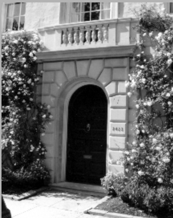
2433 Tracy Place, NW

Known in the 19th century for its idyllic landscape, Sheridan-Kalorama underwent rapid development in the early 20th century as the city of Washington's growing population moved away from the old city center in its quest for the suburban ideal. Today, Sheridan-Kalorama is comprised of a network of cohesive town-and suburb-like streetscapes. The streets are lined with a variety of housing forms, each of which contributes to a sophisticated and distinguished residential image that is unique within Washington, D.C.