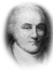
"Joel Barlow" by Robert Fulton.

and diplomat Joel Barlow bought the estate in 1807, and renamed it 'Kalorama' after the Greek word for 'fine view.' During Barlow's ownership his house became a social and politi-