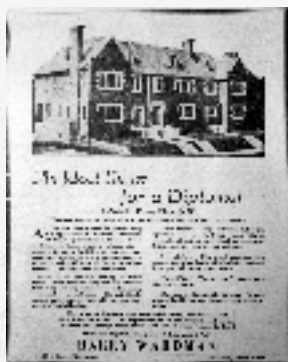
Evening Star, September 10, 1922.

By 1914, the neighborhood was also home to the Washington Seminary, at 2105-07 S Street, and St. Margaret's School, at 2115 California Street. St. Rose's Industrial School, founded by Catholic Sisters of Charity in 1868, has housed and educated orphaned teenage girls in the neighborhood since 1908. Unlike the other schools in the area which were residential in appearance, St. Rose's at 1878 Phelps Place (1908) is institutional in character and surrounded by a tall brick wall.