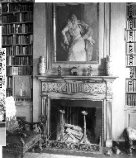
Delano House, 2244 S Street

Kalorama present a collective design so cohesive that one might think they were designed by a single hand and built as a single unit.