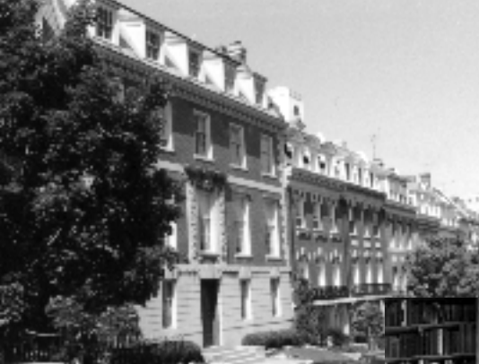
2100 Block of Bancroft Place