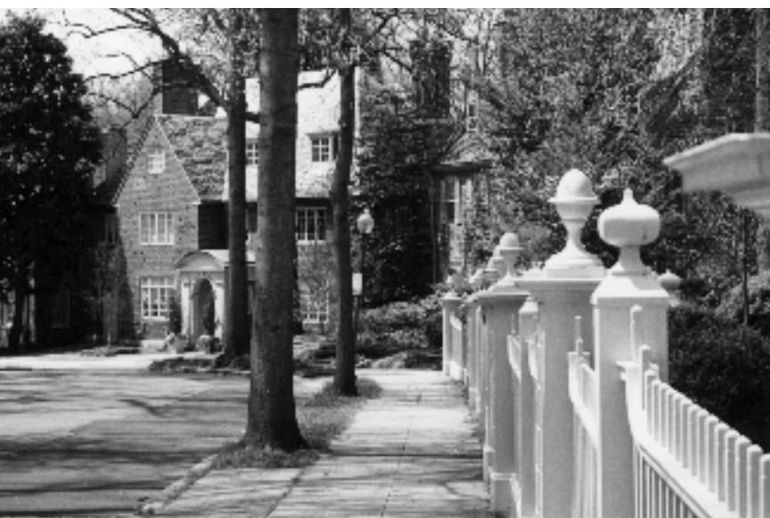
2400 Block of Kalorama Road

S Street, Bancroft Place, Leroy Place, and Wyoming Avenue in the 1890s. Large, luxury apartment buildings were constructed in the first decade of the 20th century, concentrated along Connecticut Avenue and California Street. By the 1910s, the neighborhood was firmly established as an exclusive residential neighborhood. As development continued west of 23rd Street and north of Wyoming Avenue in the 1910s and 20s, it took on a more suburban character. Individually designed detached houses were constructed by and for an affluent clientele who had the means to maintain a car rather than having to rely on the streetcar.