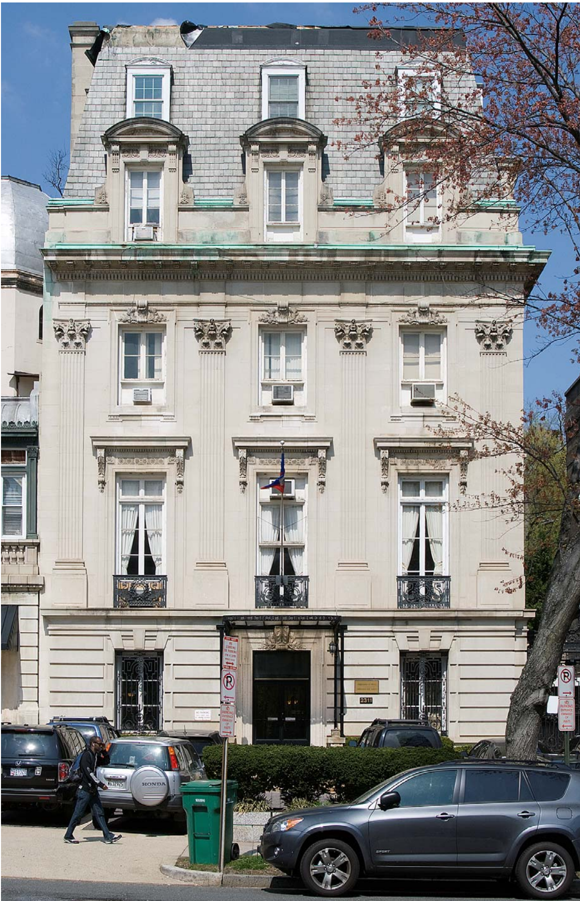
ILLUSTRATION 3: Gibson Fahrenstock House, 2311 Massachusetts Avenue NW, (Nathan C. Wyeth, 1906, constructed 1909-10). Altered after becoming Chinese Embassy 1943, now Embassy of Haiti