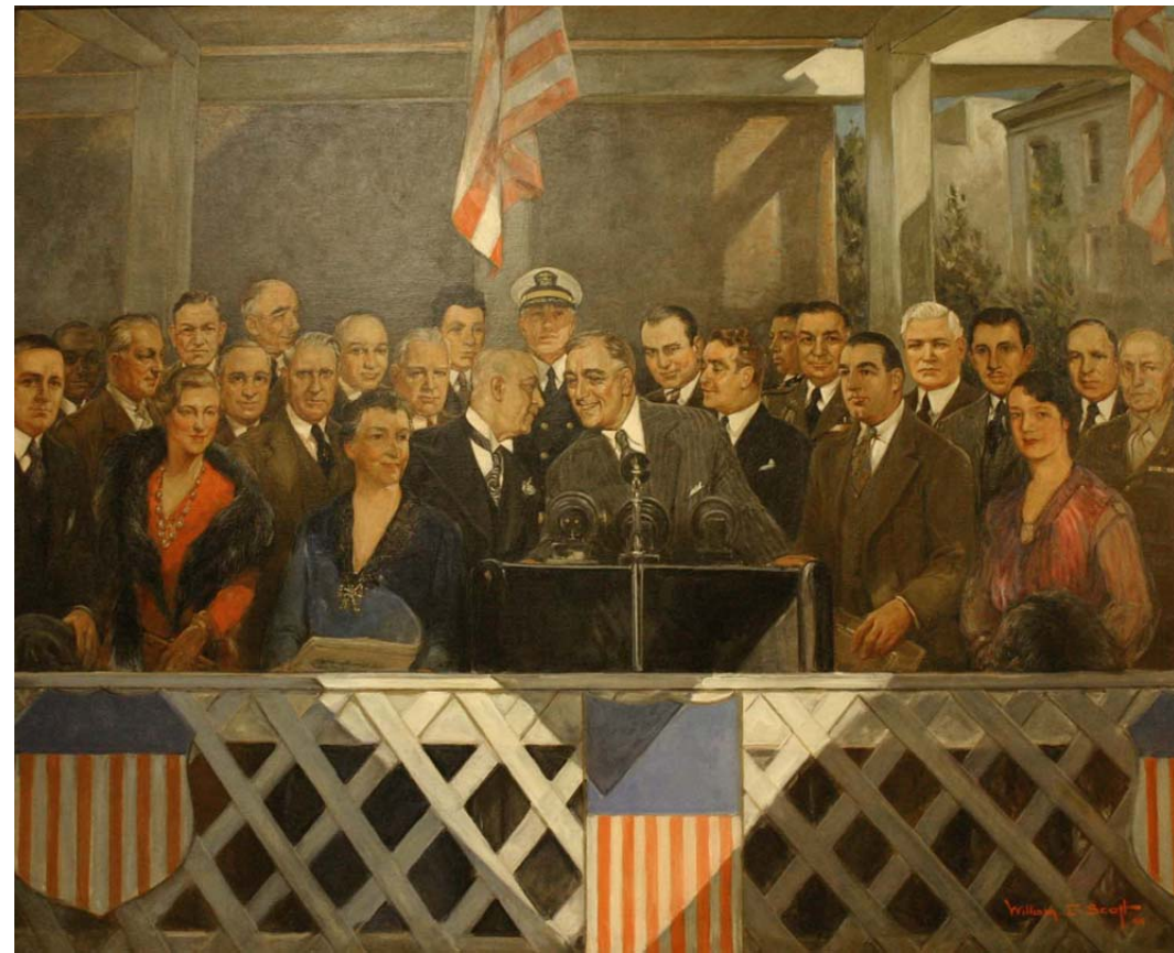
"Groundbreaking" by William Edouard Scott, (1944, oil on canvas)