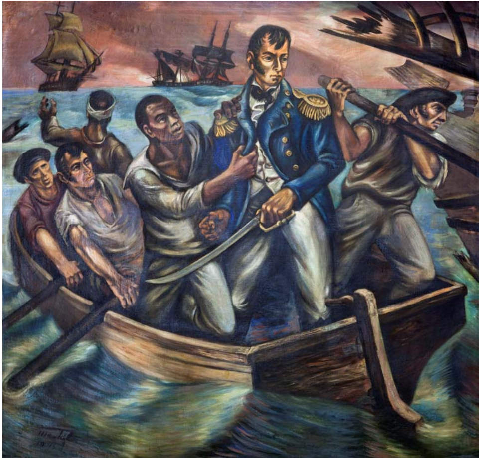
"Cyrus Tiffany in the Battle of Lake Erie, September 13, 1813," by Martyl Schweig