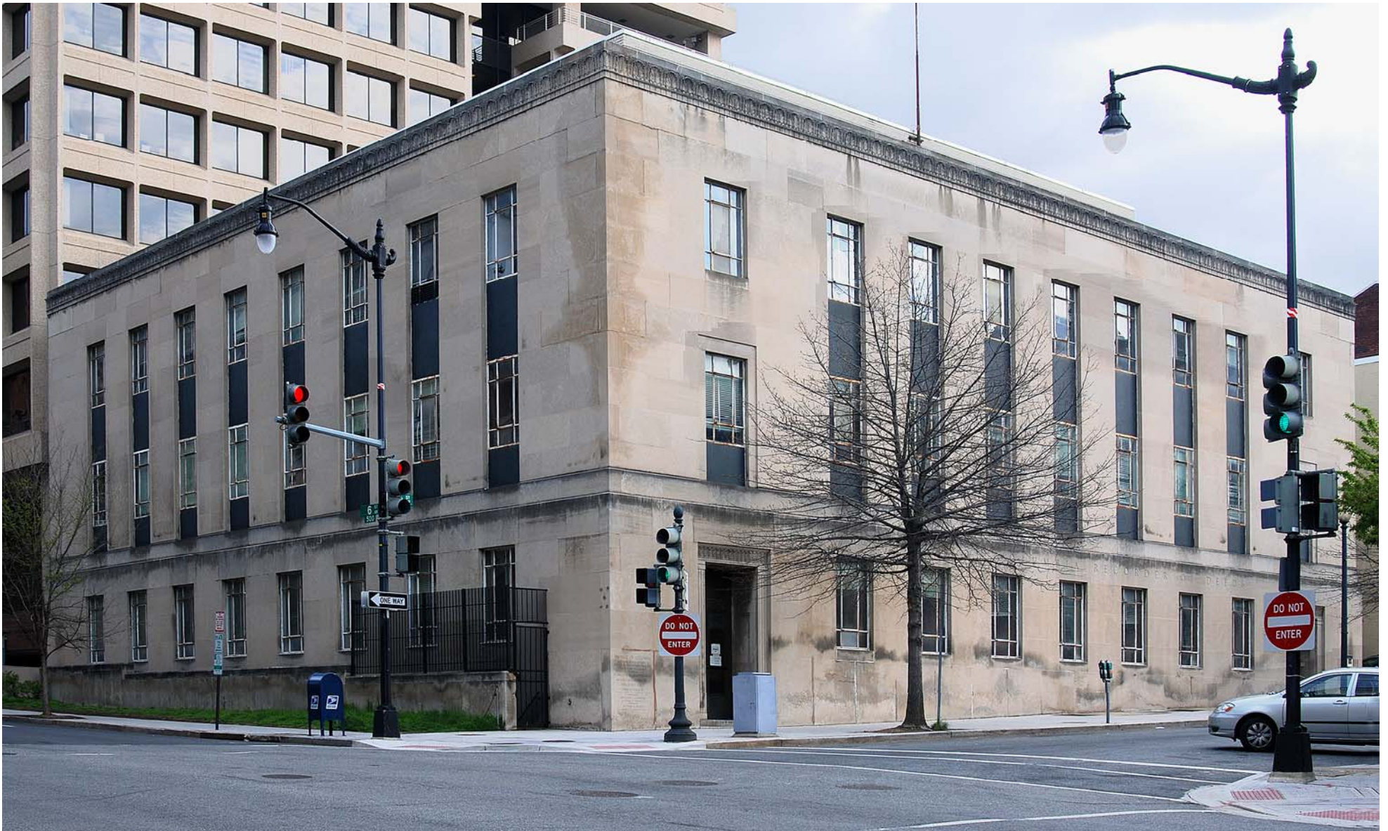
ILLUSTRATION 1: Recorder of Deeds Building (Nathan C. Wyeth, Municipal Architect, 1940-43), viewed from corner of Sixth and D Streets NW.