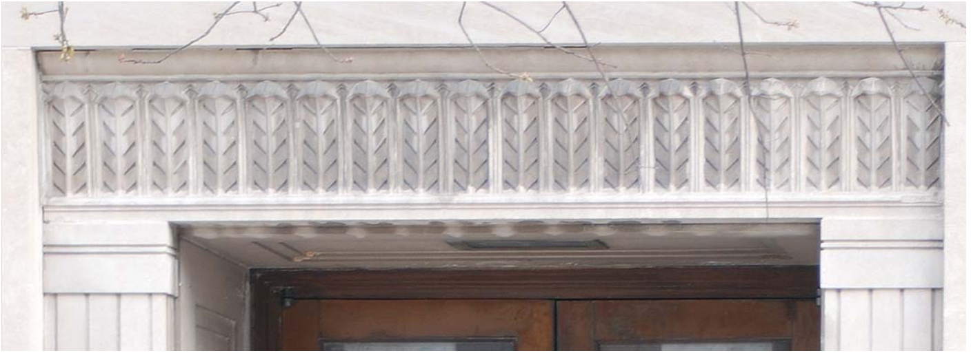
ILLUSTRATION 2: Building Detail