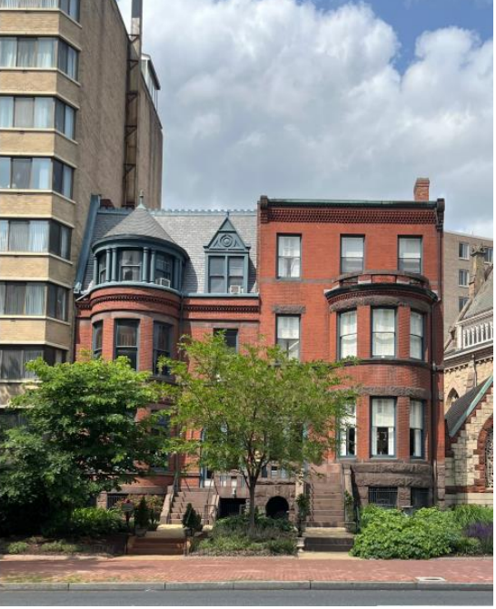
1217 and 1219 Massachusetts Avenue NW