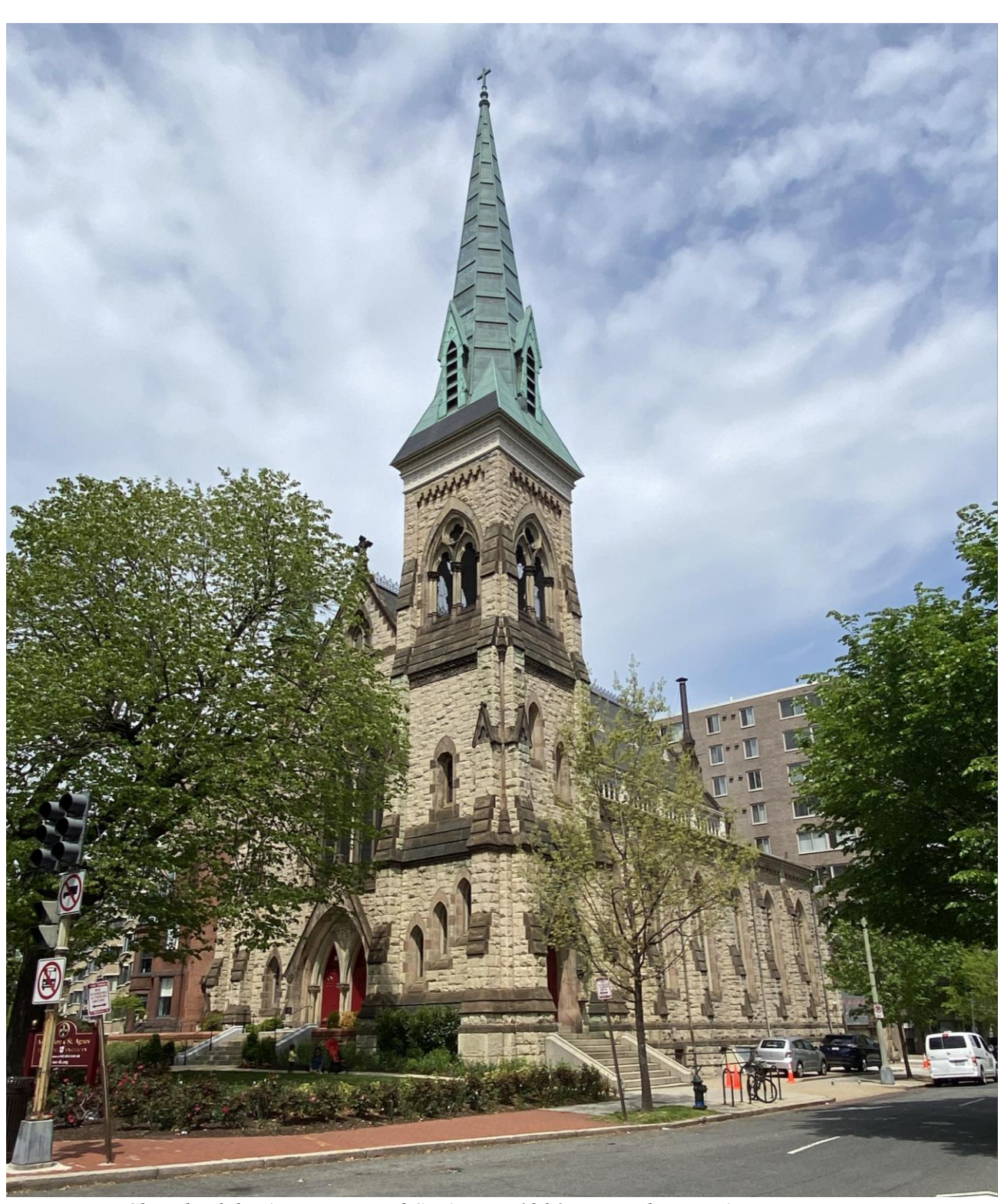
Church of the Ascension and St. Agnes, 1201 Massachusetts Avenue NW