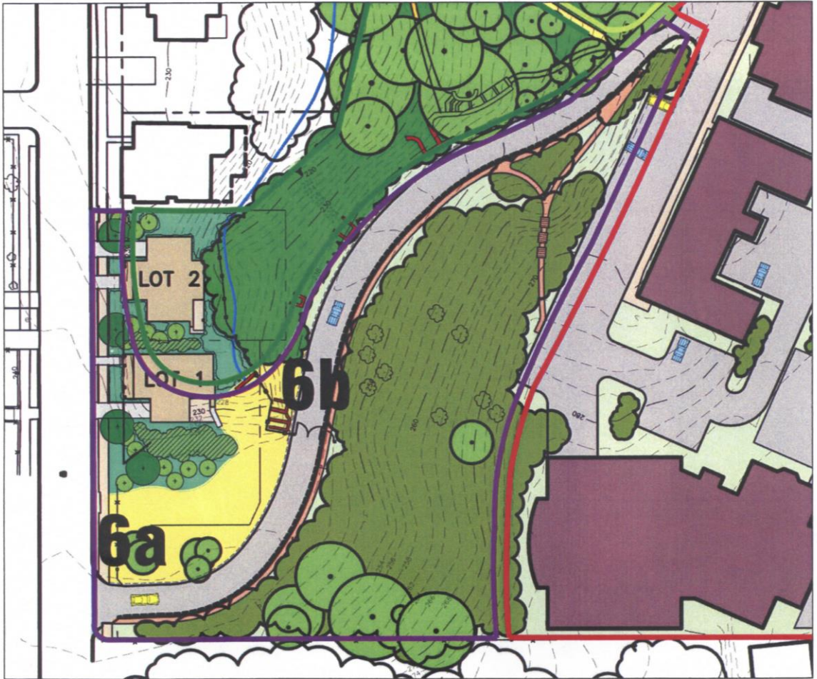
Figure VI.33. A detail of the Vegetation Management Plan shows the proposed vegetation typology for the Maccomb Entry & Woodland slope with meadow, mixed oak upland woodland, and screening plantings around the houses on Lots 1 and 2.

Page VI.50 Heritage Landscapes Preservation Landscape Architects & Planners