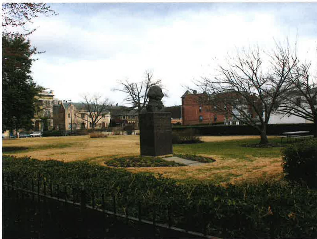
A: Structured Temple Garden from S Street