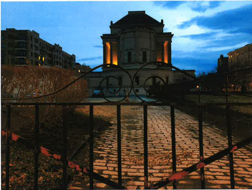
C: Rear Temple night view from 15 th Street