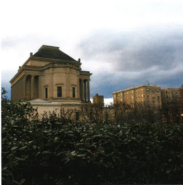
D: Structured Temple Garden and Rear View of Temple from 15 th Street