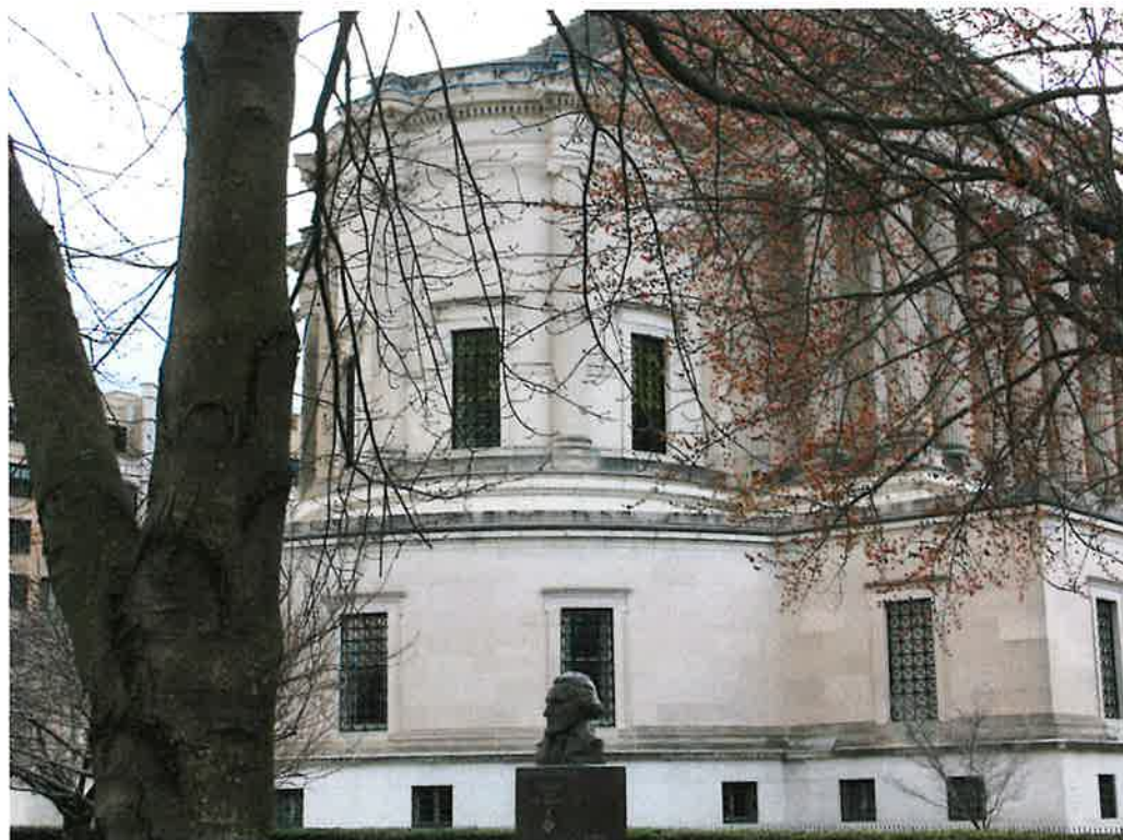
B: Rear View of Temple from S Street