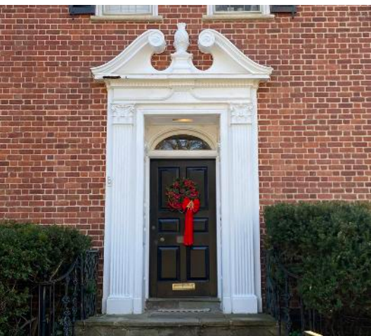
Paneled wood doors with decorative surrounds