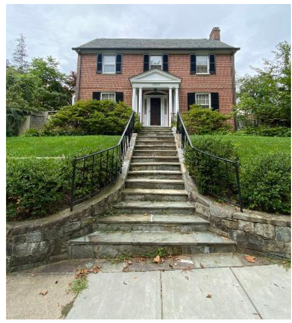
Stone steps, walkway, and retaining wall