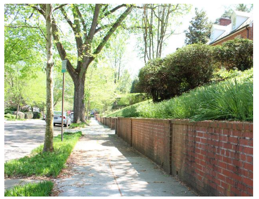
Continuous brick masonry site wall