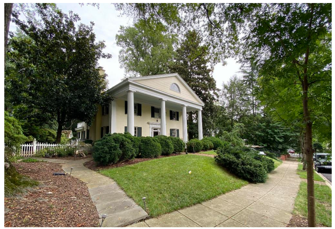
Curvilinear streetscape with houses set far back