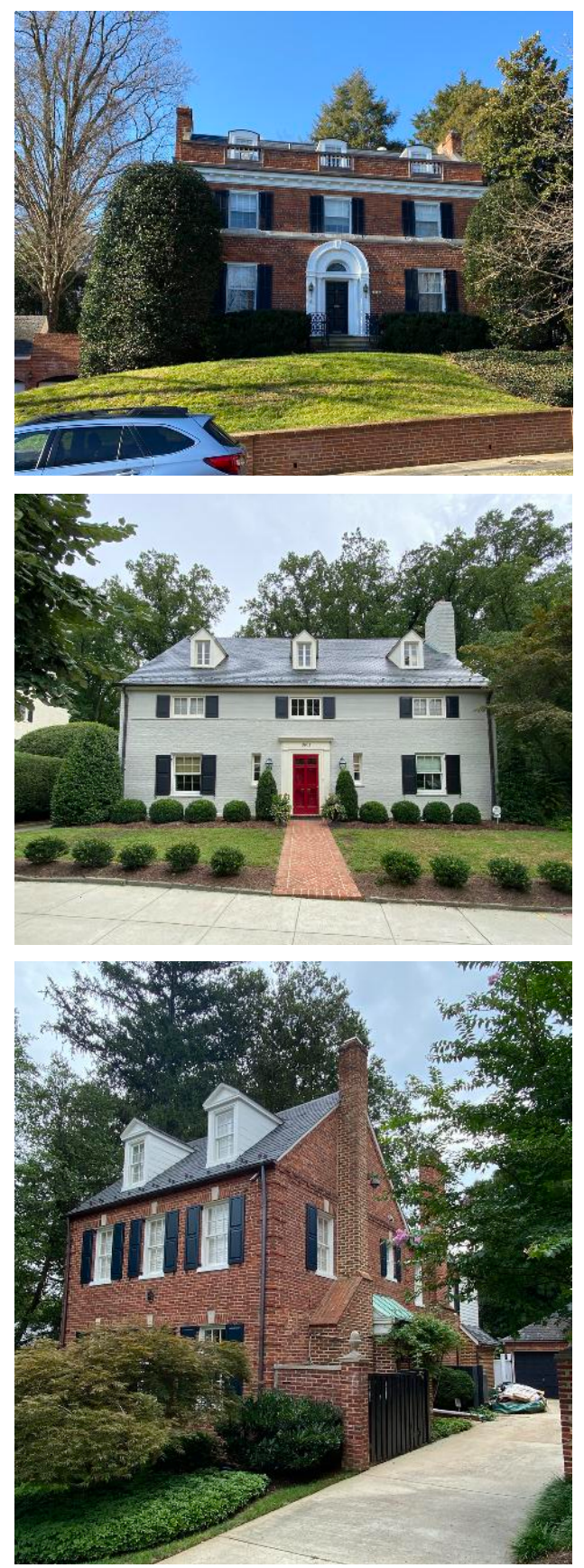
Gabled and hipped roofs with dormers and chimneys

For more information on solar installations and other sustainability enhancements, see "Sustainability Guide for Older and Historic Buildings" https://planning.dc.gov/node/1314201