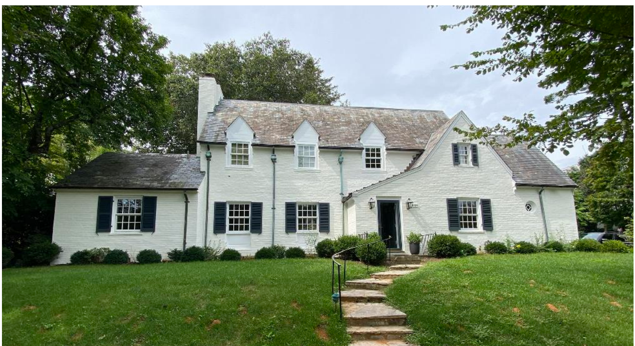
Additions should be subordinate in height and footprint and overall size to the main mass of the house.