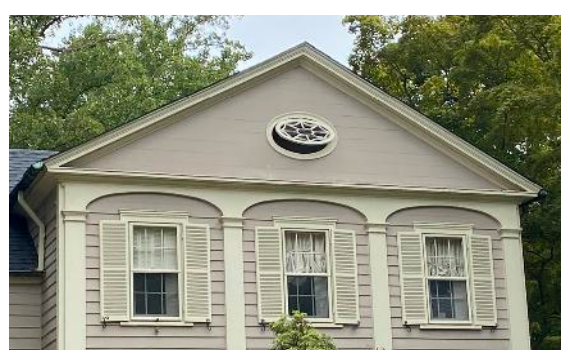
Multi-paned double hung wood windows with shutters are a defining architectural feature of Colony Hill homes.