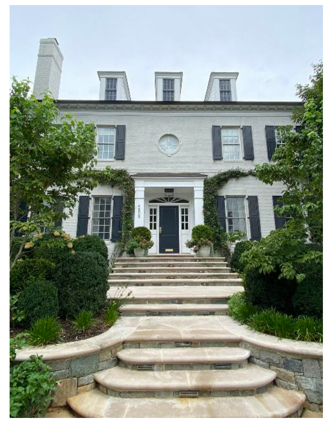
Non-contributing buildings relate to the aesthetic and visual continuity of the neighborhood.