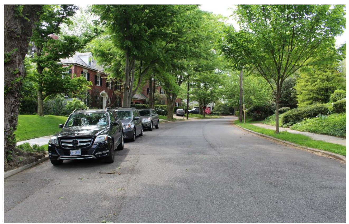
Curvilinear streets that follow the natural topography