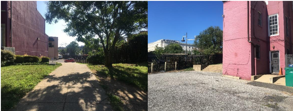
Views of the site from New Jersey Avenue and the rear alley