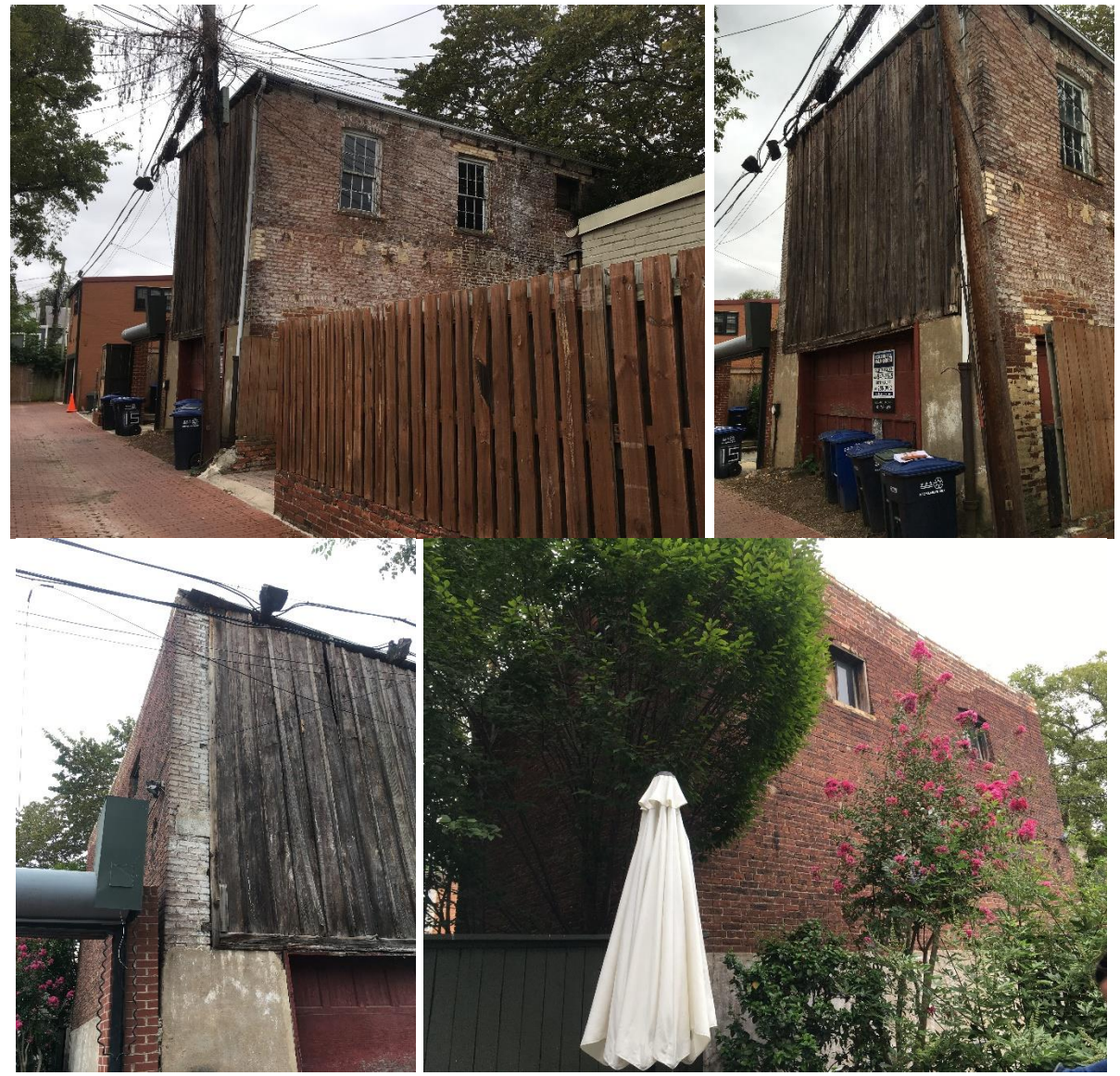
Photographs of the north, east, and south elevations of the existing two-story carriage house

The building has been altered over time. Most significantly, the majority of the brick wall on the west (alley) elevation has been removed and infilled with a single retractable garage door on the first story and clad with wood boards on the second story. The north elevation, which used to have either a roof or lean-to addition, has a pedestrian door and three windows on the first story and another three windows on the second story. At the west (rear) elevation, the wall is mostly blank and has one window on the second story. The south elevation has been parged on the first story but shows signs of horse stall windows that have been infilled. The second story has two windows. At the interior and exterior of the building there are signs of various windows being altered or infilled on the north and south elevations. It appears the building's windows would have originally had segmental arches of two header rows.