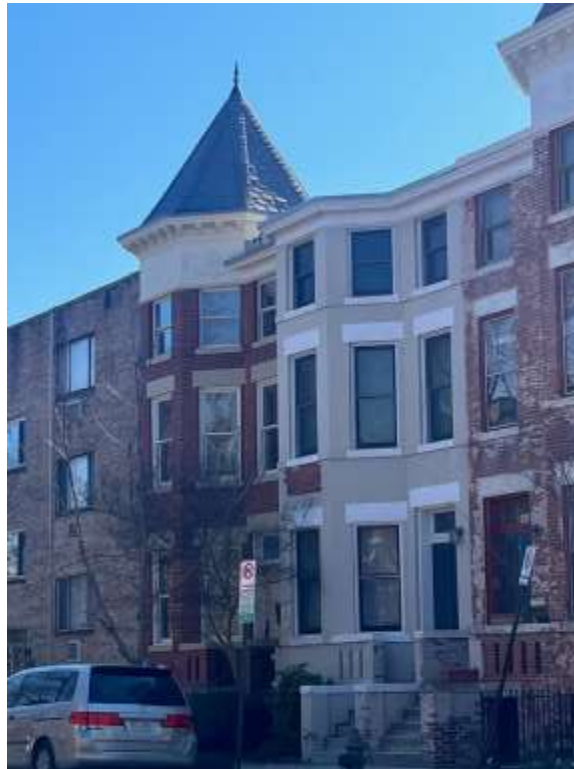
View 1105 D Street NE from intersection of 11 th and D Streets

1105 D Street NE is a two-story brick tower-front house that was built as one of three in 1903 for L. E. Breuniger and designed by N. R. Grimm. The rear of the property is visible from 11 th Street, even though it is the third house in from that street.