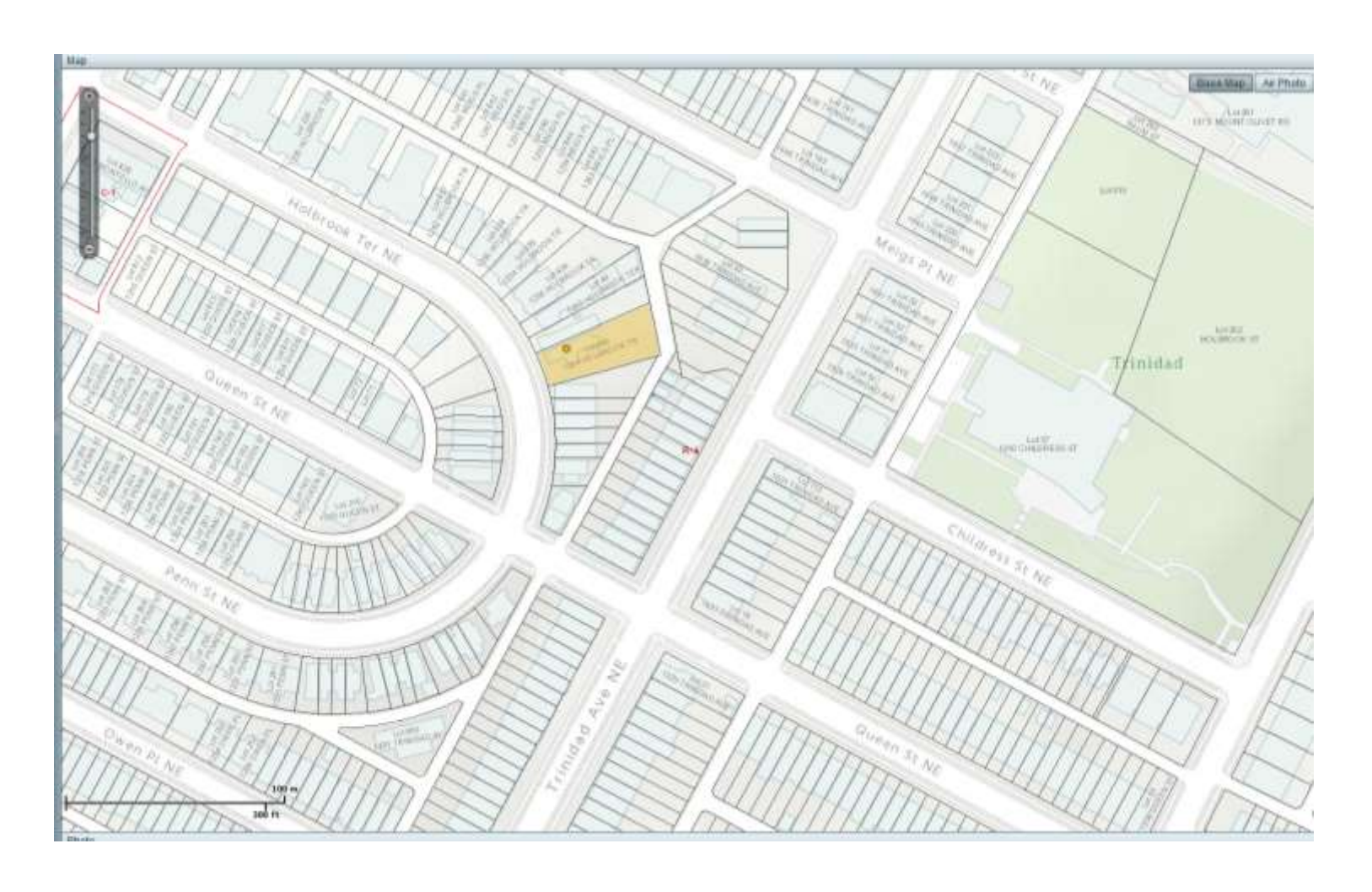
Location and Zoning Map