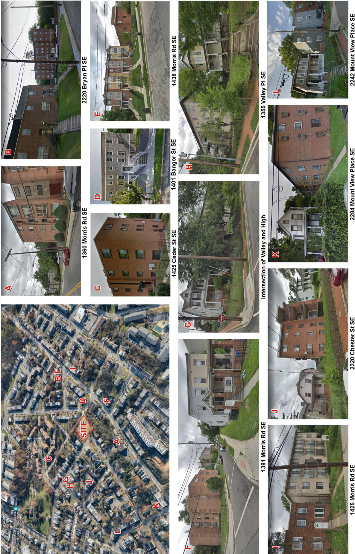
Attachment A: Context Matrix Provided by Applicant