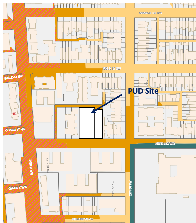
Figure 2: Comprehensive Plan Future Land Use Map

The Future Land Use Map indicates that the property is in the Medium Density Residential land use category. The proposed map amendment to the R-5-C District and the proposed density are not inconsistent with this designation. A mid-rise apartment building would be an appropriate use.