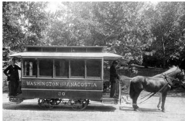
Horse-drawn streetcars began operation in 1875, to connect Anacostia with the Navy Yard.

As Anacostia grew, its streets became populated with frame, wood-sided buildings in a variety of styles. The most common housing type was a two- or three-bay house—freestanding, semidetached, or part of a row—with a pitched or gabled roof, and usually a front porch. Into the late 19th and early 20th centuries, masonry rowhouses became more common, sometimes featuring bracketed cornices, pent or mansard roofs, and projecting bays. Included today in the historic district are several examples of small apartment buildings as well as the “Washington Row” house type.