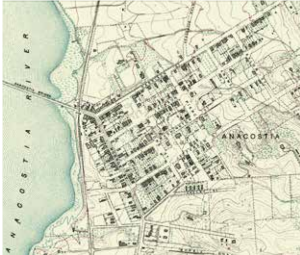
An 1888 Hopkins Atlas shows early development of Anacostia.

the newly platted town on a site commanding views of the river. Griswold's Addition, subdivided in 1879, expanded Anacostia's footprint to the southwest.