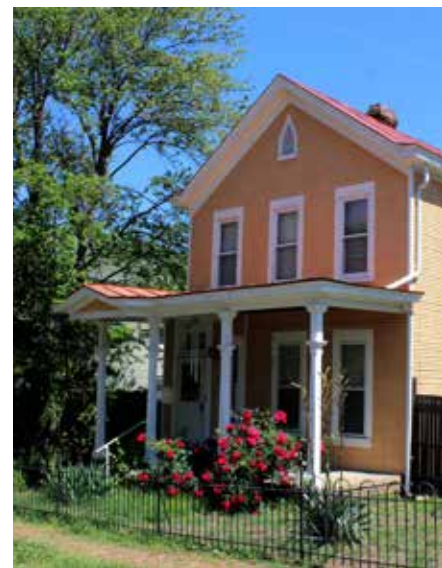
Much of Anacostia is defined by rows of houses with consistent setbacks and small front yards bounded by low (or no) fences. Privacy, functionality, historic compatibility, and aesthetics are all important considerations for landscape design.