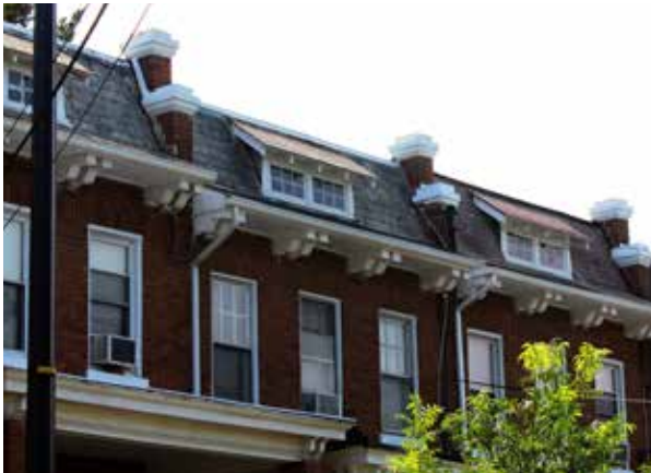
Because of their prominence and visibility, roofing materials merit special care in repair or replacement.