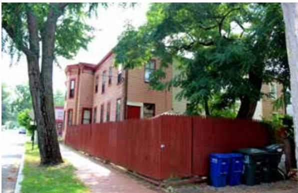
Plank fences can provide privacy for rear and side yards. Where fences face a public street, wood is the preferred material.

fences. Chain-link fences are also not appropriate for front yards, but they may be used in rear yards, as can solid board fences. City codes limit rear-yard fences to seven feet in height.