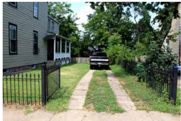
Gravel (upper image) or parallel tracks of concrete divided by turf (lower image) were common historically.