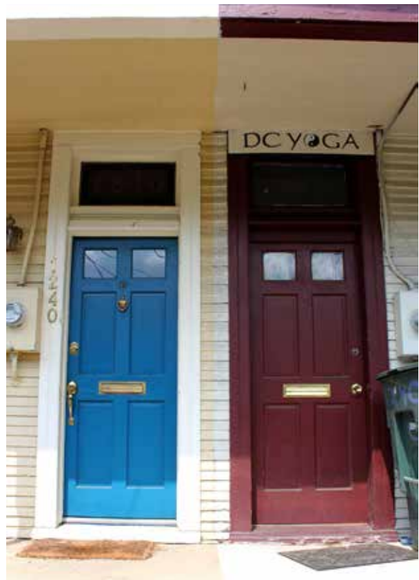
Historic wood doors in Anacostia generally had 4- or 5-paneled configurations and sometimes incorporated glazing on the upper panels.

The proportions of openings are important as they relate to the overall proportions of a building. Openings should not be widened, lowered, or narrowed. Openings should not be blocked down to fit stock doors that are smaller than the originals. Retain transoms and sidelights or replace them in kind as necessary and restore them when they have previously been removed. Do not cover or obscure transoms.