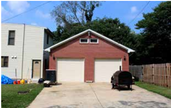
Large, suburban-style garages and driveways are incompatible with Anacostia's scale and character.

Homeowners should only add new outbuildings after careful consideration and consultation with HPO about placement, size, form and materials. They should be compatible with the existing buildings and neither overwhelm nor detract from the character of the property. Zoning regulations restrict the allowable size, placement, and use of new outbuildings. Avoid plastic- or vinyl-covered buildings and sheet-metal sheds. Instead, employ frame construction with wood and fiber-cement siding.