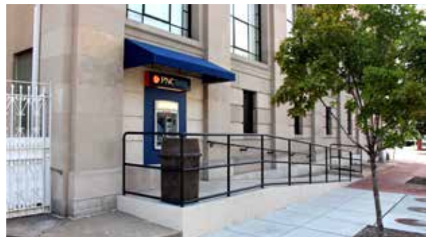
This accessible ramp provides access to a newly installed ATM. Its design and construction respected the Beaux Arts character of this monumental bank building and resulted in a minimal loss of historic fabric.