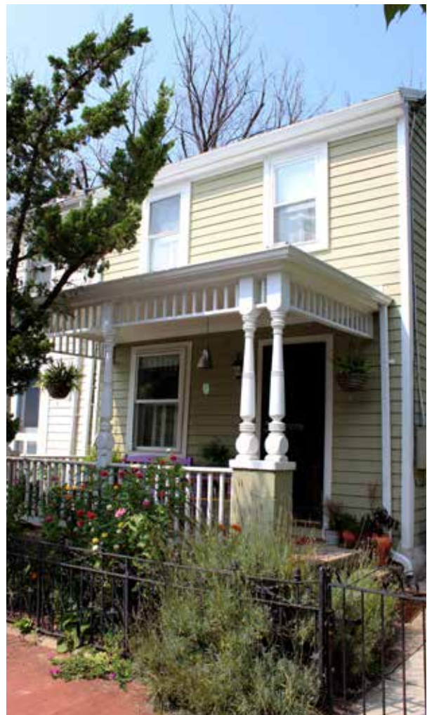
The porch of this house features a spindlework frieze, elaborately turned posts, and masonry piers.

The porches of Anacostia's historic residential buildings were among the most important of its character-defining features. Houses constructed in the late 19th and early 20th centuries often had front porches stretching partially or fully across the façade. Functionally, these porches provided outdoor living areas, sheltered entrances, and cooling shade. Front porches and steps often presented a formal appearance to the street and contained ornate details. In contrast, side and rear porches were often more informal and utilitarian in appearance.