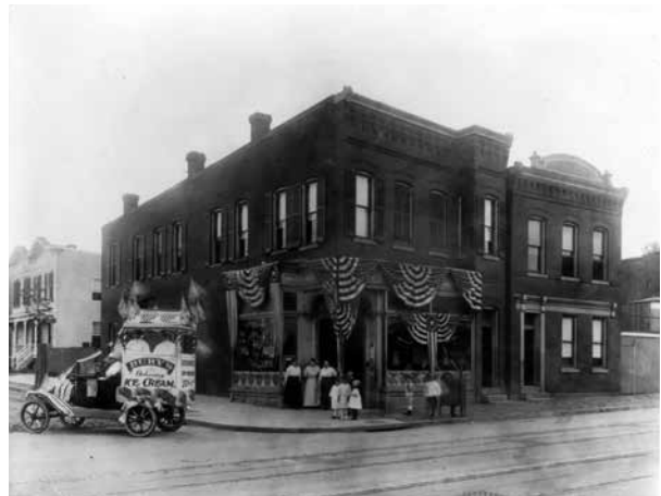
Commercial buildings on the 2200 block of Nichols (now Martin Luther King, Jr.) Avenue, about 1919.