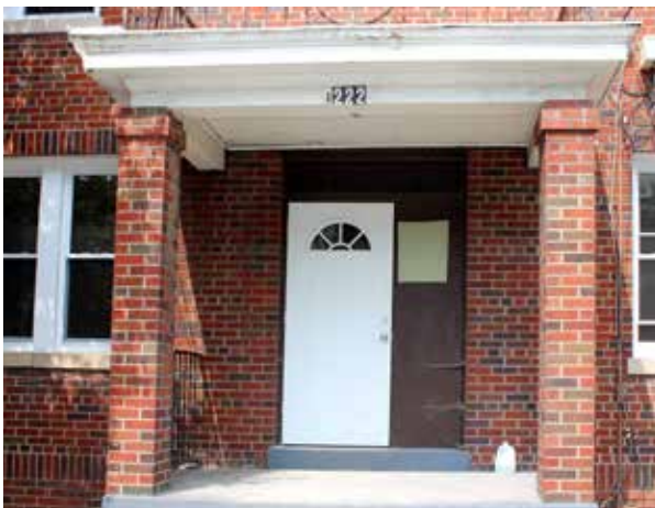
Fanlight-style doors are not appropriate replacements.

Doors with an integral arched window or fanlight are not a traditional type and should not be used on portions of a building that could be seen from the street. Fully or predominantly glazed doors are similarly incompatible.