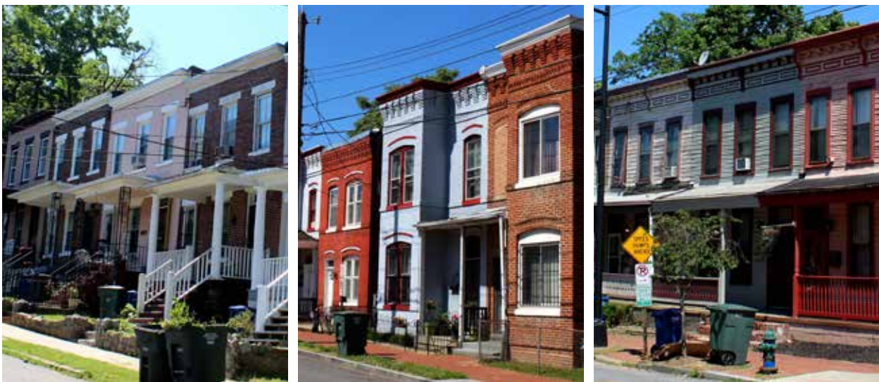
Examples of the architectural diversity found in the Anacostia Historic District