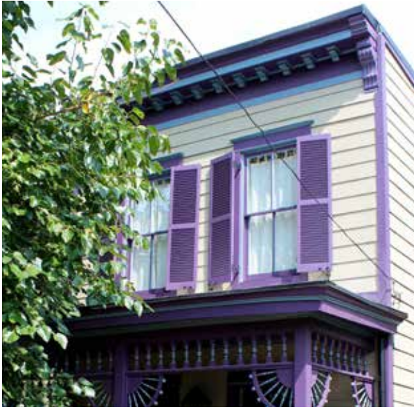
Compatible, operable louvered wood shutters