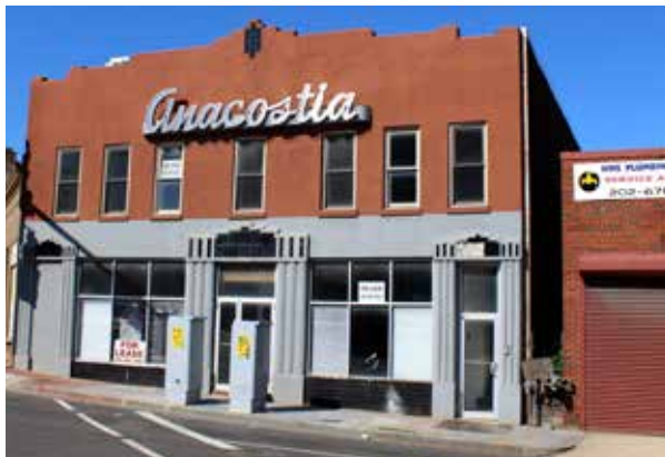
Commercial buildings in the Anacostia Historic District