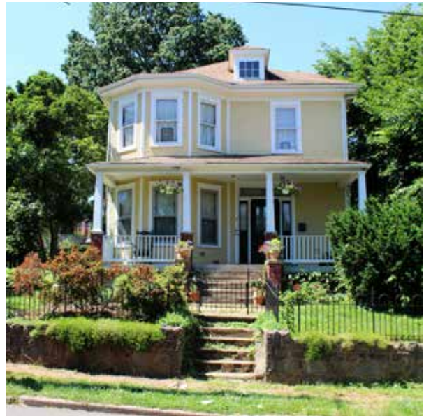
Retaining walls provide space for sidewalks, level lawns, and landscaping.

Anacostia's topography varies greatly, particularly at its eastern and southern edges. Although many original yards were relatively flat, others were leveled to create an even surface on which to build. Low retaining walls sometimes support earthen cut-and-fill that creates level lawns. Although often inconspicuous, retaining walls significantly contribute to the character of a property and its neighborhood.