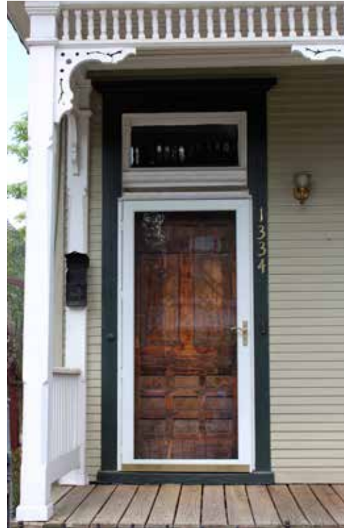
The addition of glazed storm doors allowed these original doors to be seen and protected and improves their energy efficiency.

Historically, doors in Anacostia were crafted from wood and featured four- or five-paneled configurations, occasionally incorporating glazing in place of the upper panels. Later and more elaborately stylized houses sometimes featured more decorative, multi-paneled doorways and greater expanses of glazing.