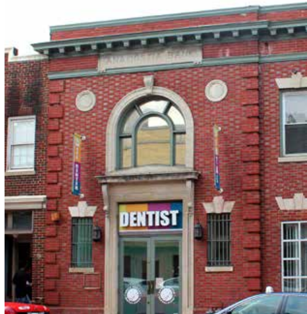
New signage on this historic bank building preserves its original architectural detailing and signage.

New signage should reflect the scale of the storefront and of the building and should not obscure its architectural features. Graphics should be easy to read, and type styles should reinforce the business's overall marketing image. Digital, flashing, or internally lit signs are not appropriate for the Anacostia Historic District.