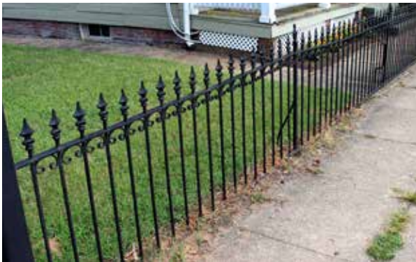
Typical wrought-iron fence patterns

fences. Chain-link fences are also not appropriate for front yards, but they may be used in rear yards, as can solid board fences. City codes limit rear-yard fences to seven feet in height.