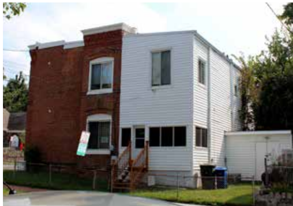
The prominence and projection of this incompatible addition competes visually with the original building. The addition's side wall should have aligned with the main house wall, which sits further in than the projecting bay.