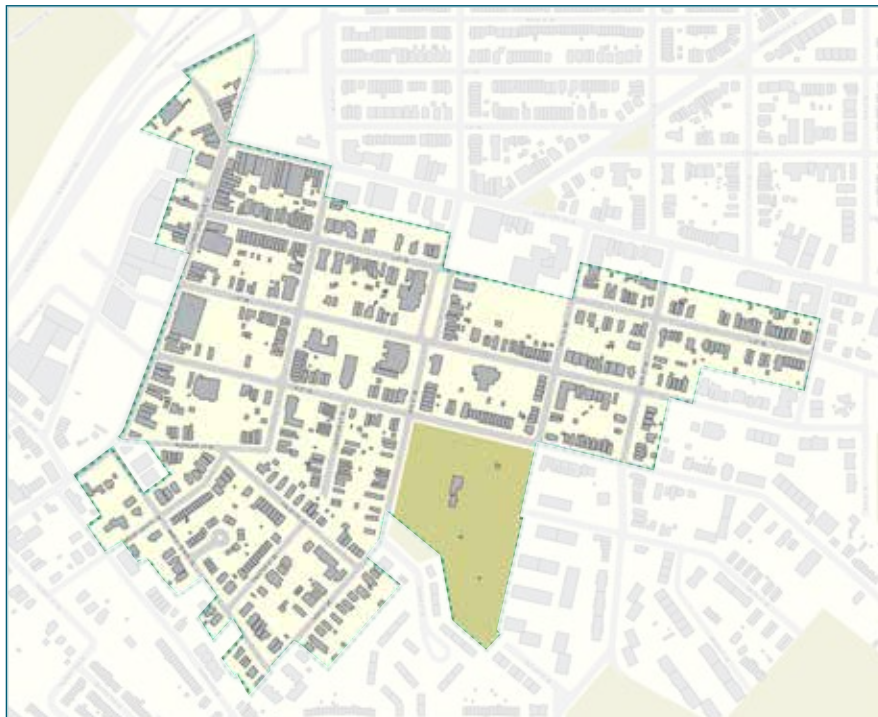
Anacostia Historic District

The DC Permit Center is located at 1100 4th Street, SW on the second floor (Waterfront Metro). For further information on building permit requirements, visit the DCRA website at www.dcradc.gov .