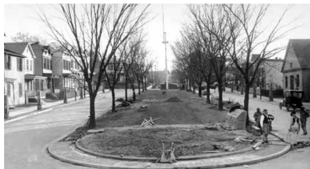
The market space along Fourteenth Street has long been a focal point of the community.