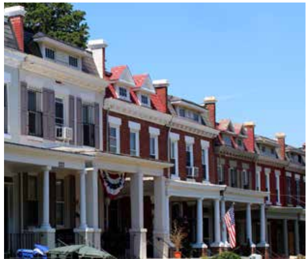
Corbelled brick details and dormers enlivened and united rows of houses.

For roofs visible from the ground, it is important that replacement roofing material be consistent with its original character. Roofs in Anacostia were originally covered by sheet metal or pressed-metal shingles, slate, or wooden shingles. These remain the most compatible and preferred materials. Asphalt shingles or faux slates may be suitable for buildings whose roofs are not prominent and for roofs that originally had wood shingles, but they are not suitable for mansard or pent roofs, as they don't match the texture, size, or appearance of the original materials. Houses with highly visible and complex roof forms or where pent roofs form part of a contiguous row