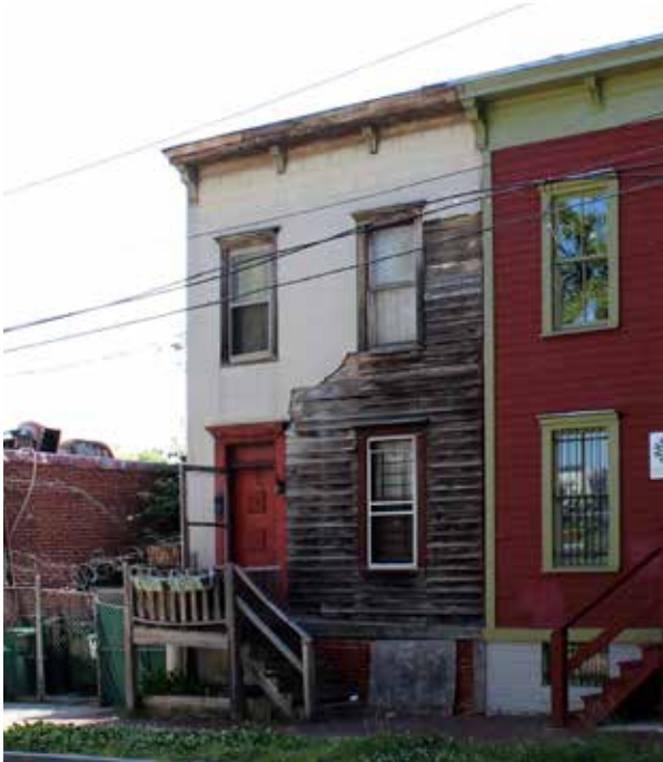
Here, stucco was applied directly atop the earlier cladding.

Throughout the 20th century, it was a common occurrence for replacement materials to be applied directly atop the existing siding. These materials, including vinyl and aluminum siding, stucco, and formstone veneer, served to encase and preserve the original siding. It is often possible to remove the later cladding and restore the original, repairing or reusing the existing materials.