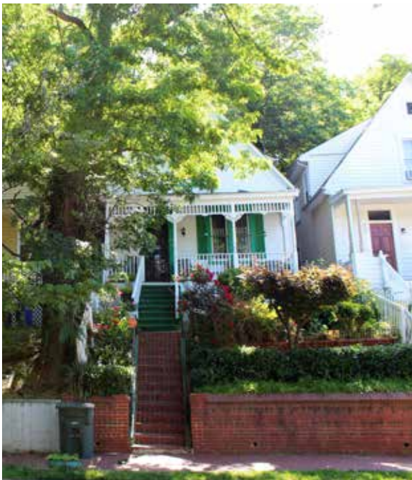
The design and material of new retaining walls should respond to the character of their associated houses.