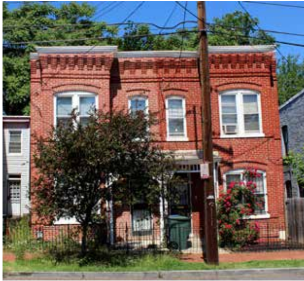
The house on the left was recently repointed. The mortar successfully reproduced the composition and color of the original.

Painting is not necessary to protect brick. Painting brick is not a recommended treatment for unpainted masonry, as it conceals its characteristic warmth and tonal variation and may also damage the wall by trapping moisture inside. Once painted, masonry must be maintained by repainting every few years.