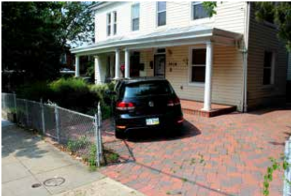
Parking spaces never belong in the front yard. The extensive paving used to create this drive is not compatible with the character of the original landscape.

Historic drives can be found in a range of materials including asphalt, concrete, and gravel. Traditionally, brick, stone, and patterned concrete were not used for driveways in the city's historic districts. Concrete was the typical material used for driveways created in the automobile era. Many early driveways consisted of only two parallel paved tracks, divided by a panel of turf. Traditional concrete was a gray-buff color, with large, exposed aggregate, distinct from the bright white or dull gray concretes with tiny aggregate that are commonly poured today. Rear parking pads may employ a broader range of materials.