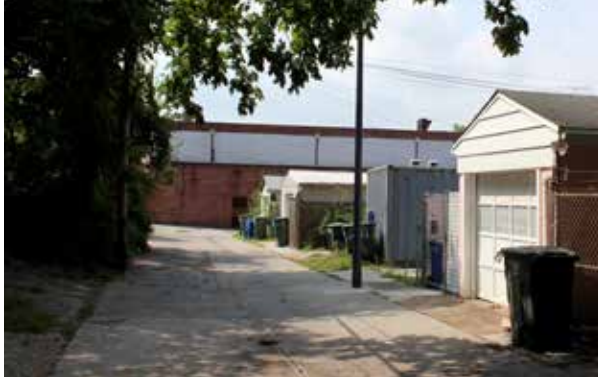
Most outbuildings face alleys and are modest and utilitarian in character.

The few existing historic outbuildings should be treated in the same way as historic homes and commercial buildings. Owners should not remove or inappropriately alter them.