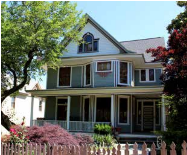
Queen Anne-style buildings often featured a greater variety of window shapes & glazing.

For additional information, see the Window Repair and Replacement Preservation and Design Guidelines .