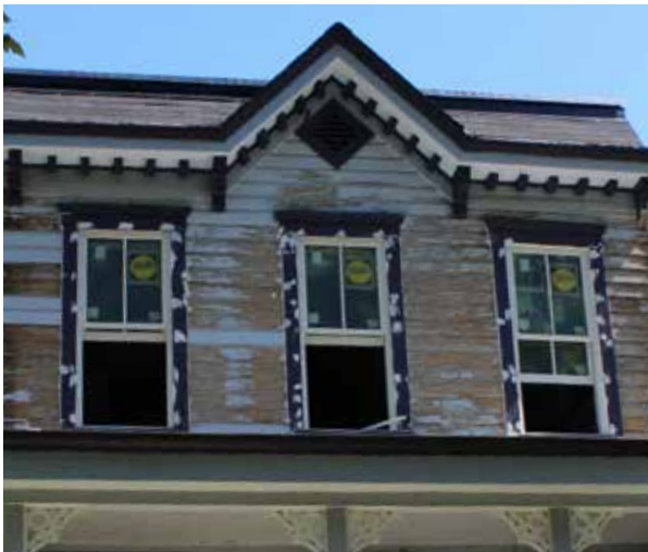
New windows match the historic appearance and glazing pattern of the windows they replace.