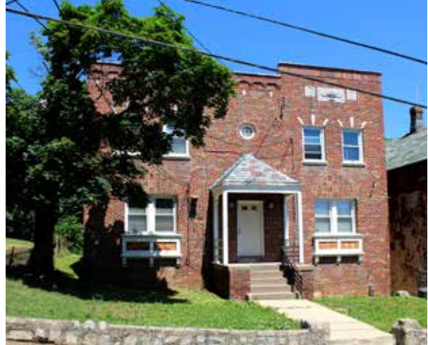
The façade of this small apartment building incorporated a mix of masonry materials and patterns.

Brick is a durable material that requires little maintenance. However, mortar joints within brick walls are prone to deterioration and require repointing every few decades. Repointing—which involves replacing some of the mortar holding the