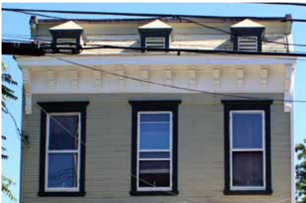
Decorative wood cornices or pent roofs embellished façades and concealed sloping roofs.