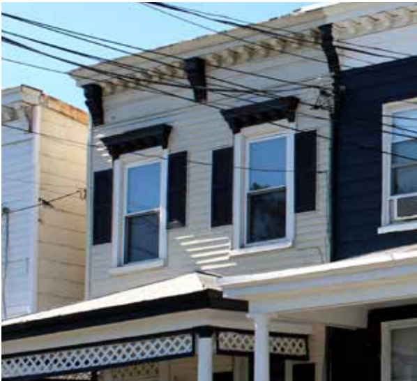
These incompatible, fixed vinyl shutters do not match the height or width of their windows.

The windows of Italianate, Cottage, and Queen Anne-style buildings also sometimes featured shutters. If replacement shutters are being considered, operable louvered wood shutters should be used. If operable windows cannot be used, the shutters should be sized to correspond to the width of the window and hung in such a way as to appear operable. Fixed vinyl shutters are not appropriate for historic properties.