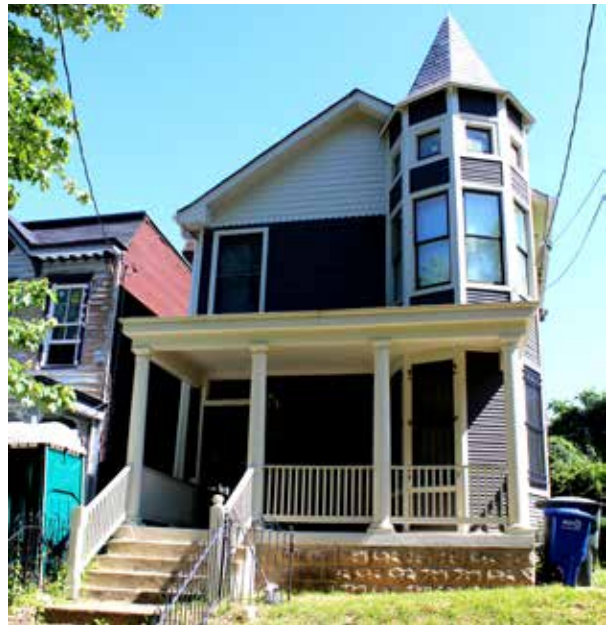
Detached houses with gabled roofs occur throughout Anacostia. Such houses occasionally incorporated towers or cross gables.