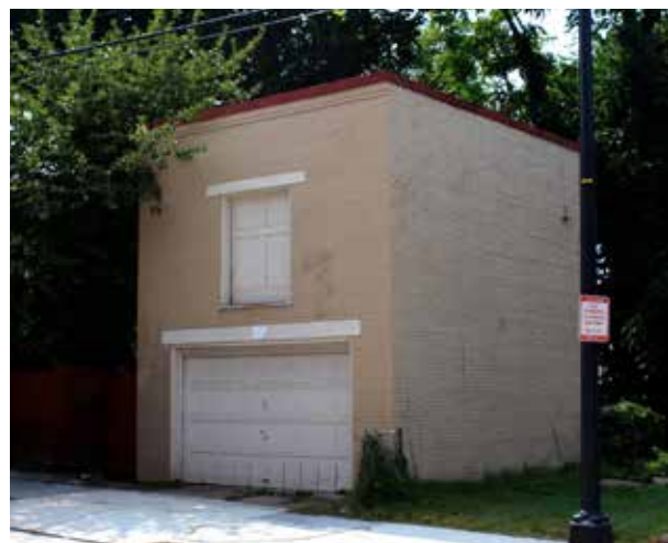
Historic outbuildings are rare in Anacostia and should be maintained as important contributing structures.