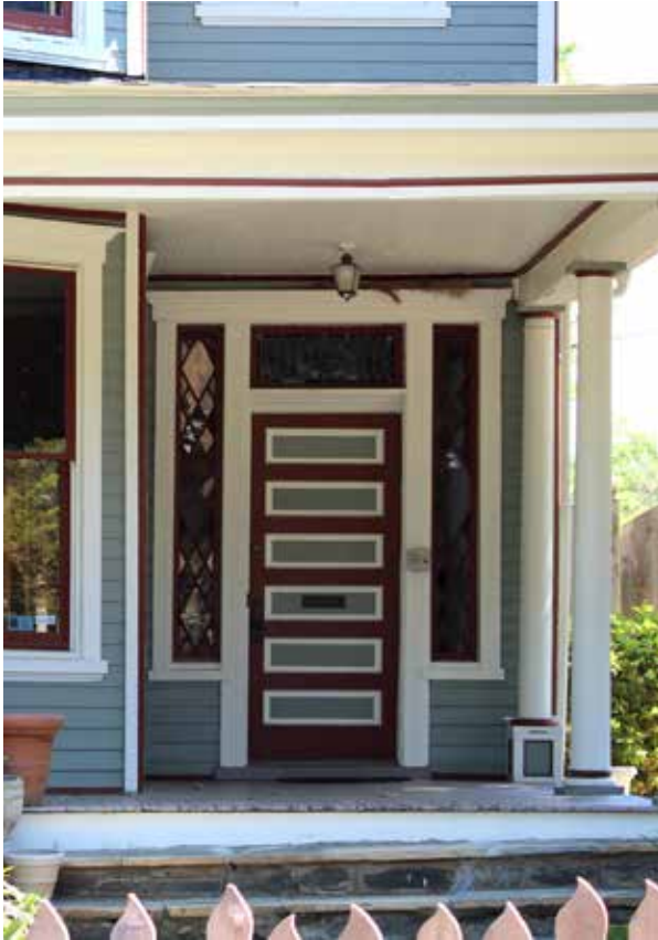
Preserve original doors, transoms, and sidelights as important character-defining features.

Doors with an integral arched window or fanlight are not a traditional type and should not be used on portions of a building that could be seen from the street. Fully or predominantly glazed doors are similarly incompatible.