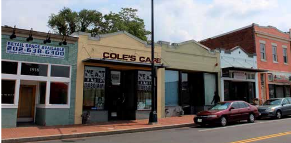
Contributing commercial buildings in the historic district are rarely more than one or two stories in height.

Above or around the display windows, commercial buildings in Anacostia also occasionally featured decorative cornices or moldings, recessed entries, awnings, canopies, or transom windows. These elements helped to define the display windows and differentiate them from the floors above. These features should be retained and not filled in or obscured by signage.