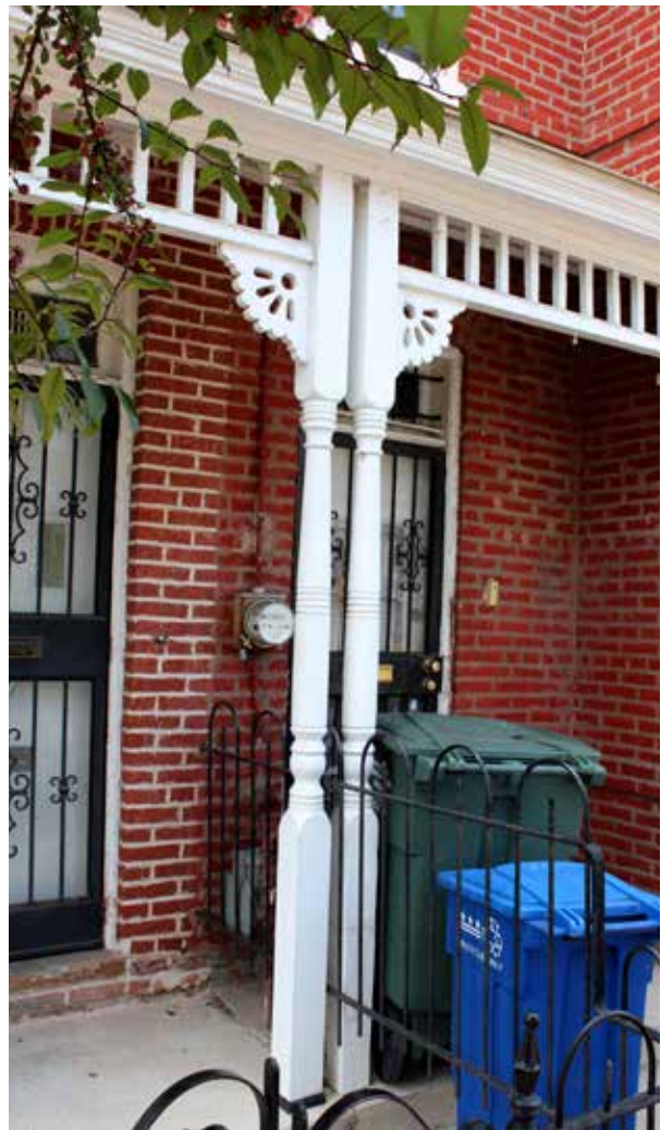
The elements on the left are modern replacements replicated to match existing components on the adjoining house.

Wood porch decking is typically three-inch-wide, tongue-and-groove boards, which can be purchased from a lumber yard, kiln-dried after treatment, (KDAT) and pre-primed. Historically, front porch railings were low, between 28 and 32 inches; replacements should match the original height (a code waiver is available for historic buildings). Due to the lower railings, porch posts had lower bases and a taller central turned section than most modern ones. A little extra effort, such as ordering online from a millwork company, will generally turn up a suitably proportioned post.