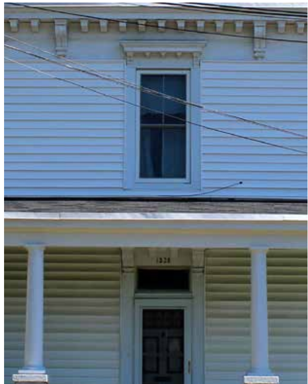
Window and door surrounds often reproduce elements found elsewhere on the building on a smaller scale.

When conducting window or door repair or replacement, these features should be inspected and repaired if necessary. Recommended treatments include the replacement or consolidation of rotting parts; re-glazing and re-puttying as necessary; caulking; and, of course, regular painting. On new construction, window openings should have traditional casings (or brick molds, in the case of a masonry building).