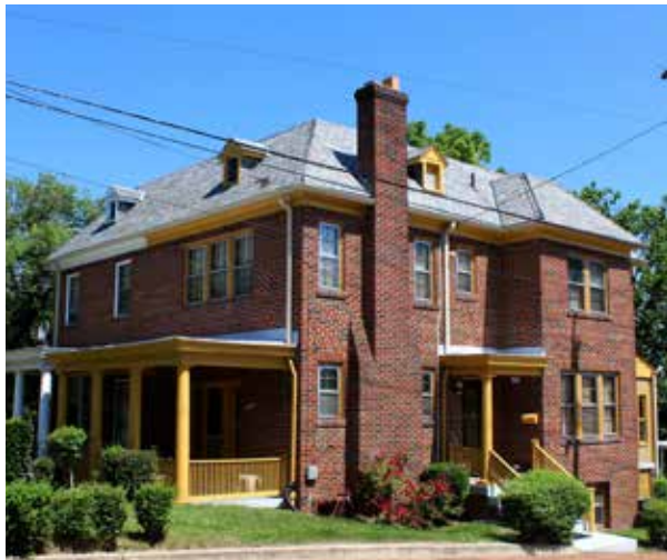
The tone and pattern of the masonry on these houses contribute significantly to their character.