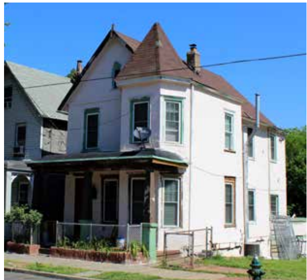
Satellite dishes and other appurtenances do not belong on the front of a building or in prominent locations atop porches, mansard roofs, and turret.

Other roof appurtenances, such as skylights, antennae, satellite dishes, mechanical equipment, and solar or photovoltaic panels, may be appropriate on buildings with flat or nearly flat roofs where these features can be located so that they cannot be seen from the street. Such appurtenances should not result in the removal, damage, or alteration of character-defining roof features, including turrets, cornices, decorative chimneys, porches, or distinctive roof shapes. Considerations for judging these should include not only immediate views but also more distant oblique views.