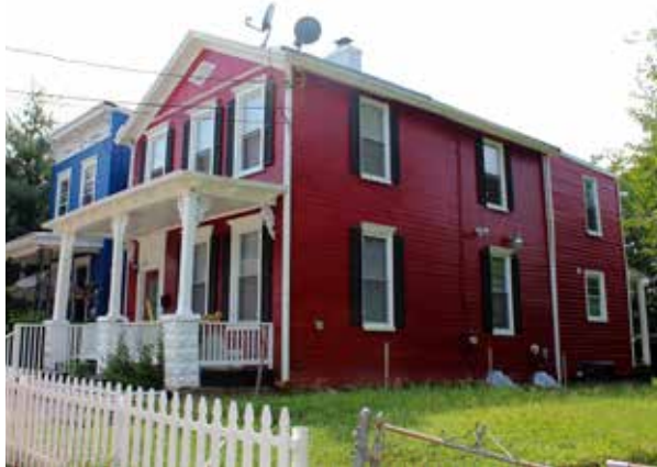
In this compatible rear addition, altering the profile of the siding, the roofline, and the window size clearly defined the addition as distinct from the original building.

Typically narrow side yards and abutting buildings in Anacostia leave no room for side additions. When a detached or semidetached house stands on a wide lot, however, it may be possible to extend sideward, but such an addition should be substantially smaller than the main block and be set well back from the primary façade to allow for a distinct massing from the original building. As they are typically seen in relation to the front elevation, side additions should be designed to be compatible with the main block in materials, massing and proportions.