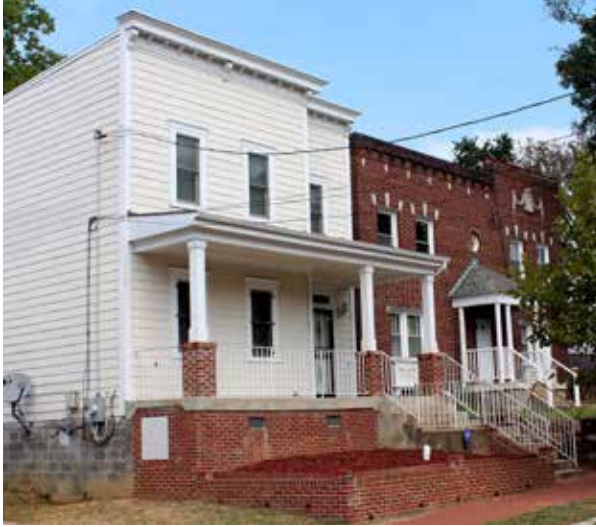
Fiber-cement siding was used on this new building.

Vinyl, aluminum, and masonite siding are not compatible with historic buildings, as they have finishes, textures, and character that are distinctly different from wood. For elements such as corner boards and cornices, materials such as cast epoxy, PVC, polyurethane, fiber-cement, and fiberglass may be compatible. Materials intended to simulate wood should always receive a painted finish.