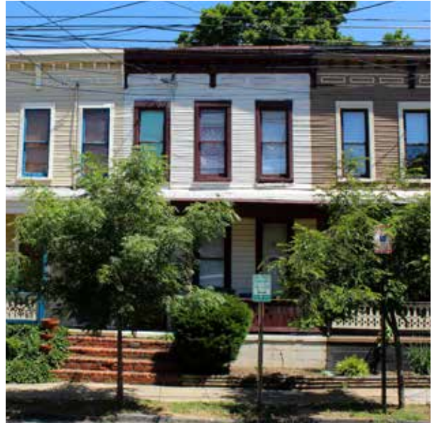
Primary, street-facing elevations typically featured the most expensive and decorative finishes and features.

Most historic buildings in Anacostia had a primary wall that faced a public street. This wall usually contained the front entrance, was formally composed, and featured higher-quality materials. Primary walls also may have contained elaborate ornamentation and intricate details. Altering primary elevations is generally not appropriate, and features should be repaired or replaced in kind.