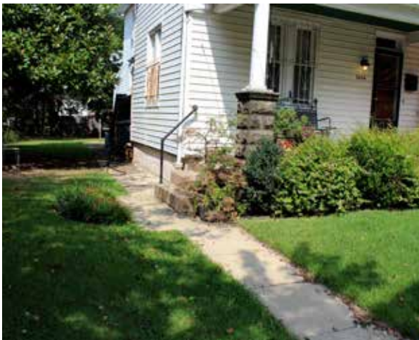
A narrow, direct sidewalk is the preferred type.

Depending on the property, a variety of paving materials may be appropriate. Examples in Anacostia have historically included brick, gravel, and flagstone. Buildings erected during the 20th century most commonly relied on poured concrete, and it remains the most appropriate material. Stamped or tumbled concrete pavers are only acceptable for walks in rear yards.