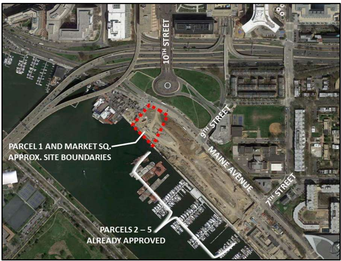
Wharf Parcel 1 – 2015 Aerial Photo

The Wharf project site is generally bounded on the north by the fish market, on the northeast east by Maine Avenue, and on the west by the proposed extent of the piers of the new development. To the south the Wharf extends approximately to N Street. The northern half of the Wharf site, from Maine Avenue and 7<sup>th</sup> Street north to the Fish Market, is currently under construction, along with Parcel 11 at M and 6<sup>th</sup> Streets. Parcel 11 includes a 57 foot, five story residential building, which is progressing toward completion, and a church which has yet to break ground. The northern portion of the Wharf was excavated and construction has begun on the parking garage that will be underneath Parcels 1 through 5. Utility work has also been done in Maine Avenue.