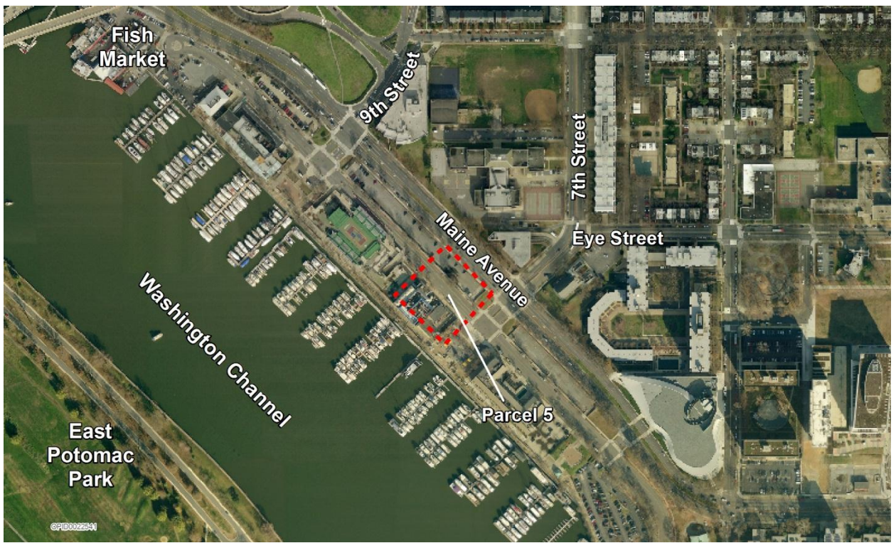
Southwest Waterfront Parcel 5 - Red dashed line indicates boundary of the current application

The subject site for the current application is one parcel within the SWW, as shown below.