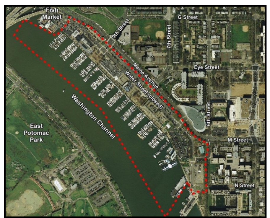
Southwest Waterfront - Red dashed line indicates boundaries of the entire SWW project

The entire SWW project site is shown in the aerial photo below. The property is generally bounded on the north by the fish market, on the northeast east by Maine Avenue, and on the west by the proposed extent of the piers of the new development. To the south the SWW extends approximately to N Street.