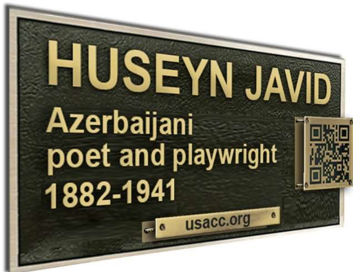
Bronze tag (with bronze screws)