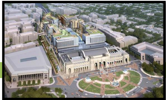
Proposed Union Station and Burnham Place

The DC Office of Planning is conducting the Downtown East Re-Urbanization Strategy in partnership with the Downtown BID, Mount Vernon Triangle CID, and NoMa BID, as well as with relevant District and federal agencies. The project began in earnest in early 2015 and will run for approximately eight months.