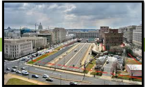
Ongoing Capitol Crossing Air-Rights Project