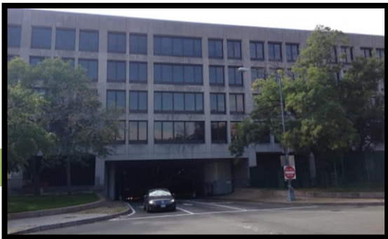
Interrupted Streetscape and Limited Pedestrian Access