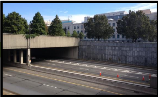
Broken Connectivity at the Freeway