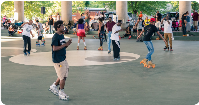
Civic + Open Spaces

OP guides development in the District of Columbia's distinctive neighborhoods by engaging stakeholders and residents, performing research and analysis, and publishing planning documents, including the Comprehensive Plan .