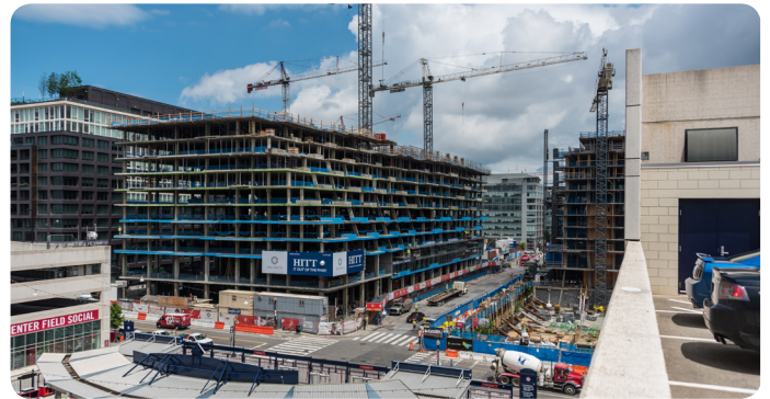
Economy + Land Use