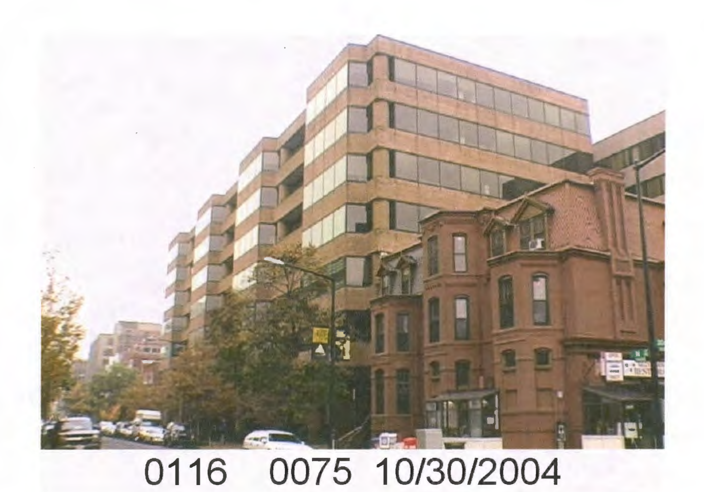
1920 N Street NW – modern eight story office building, center left.