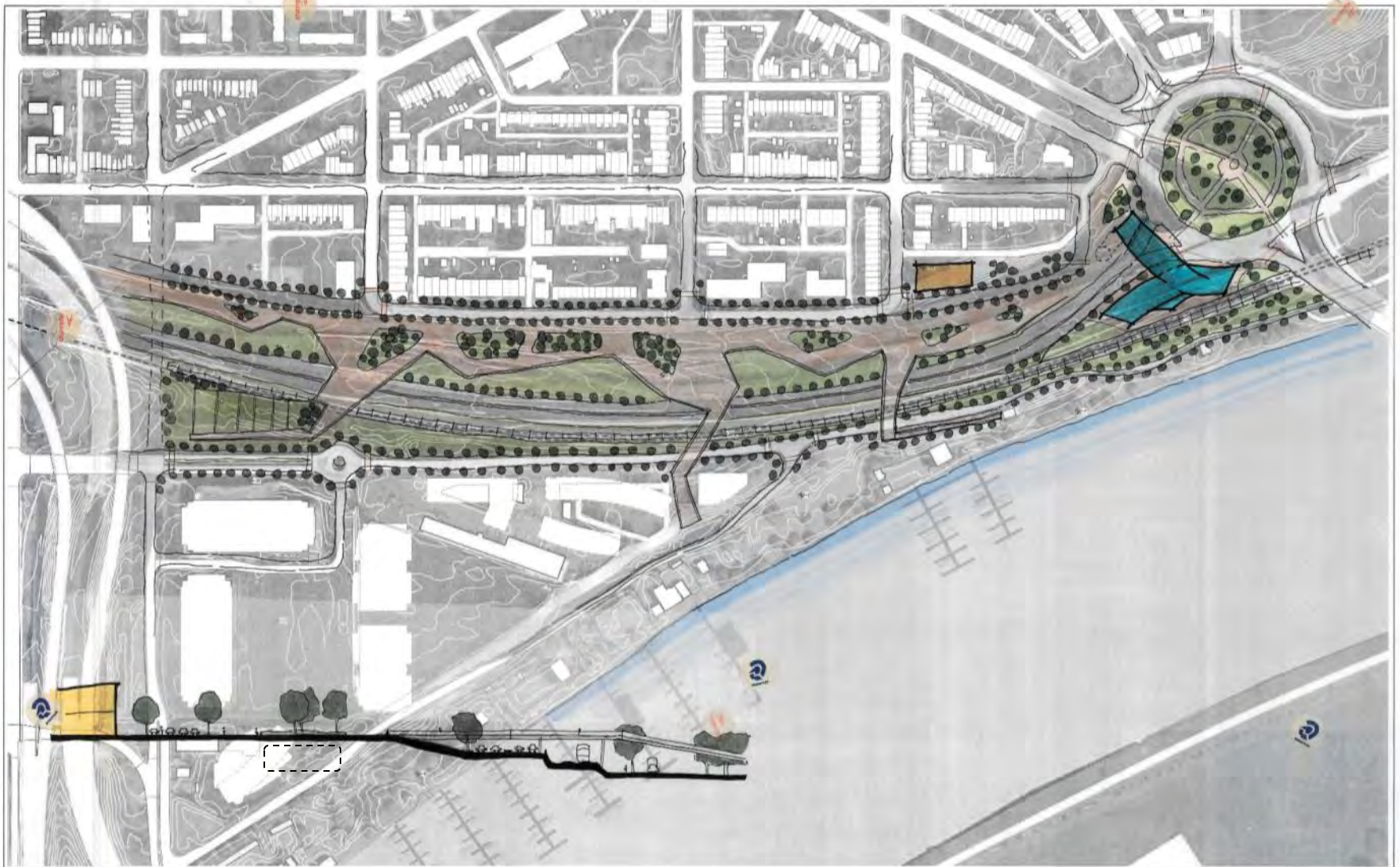
SITE PLAN 1-100 1" = 100'-0"