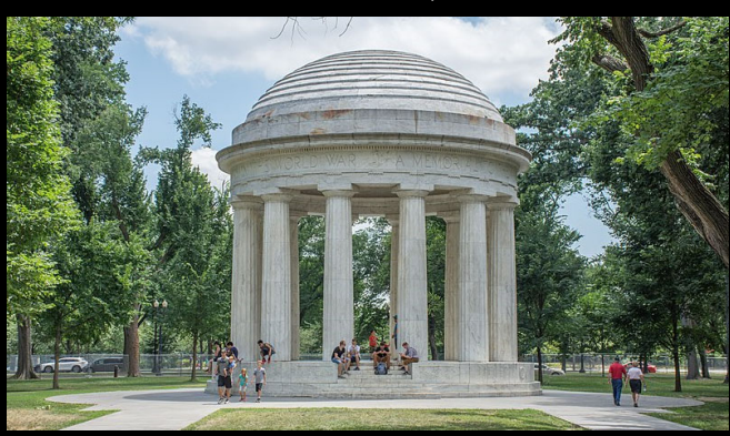
DC World War Memorial, National Mall