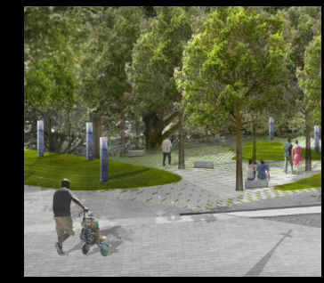
Metro Memorial Park 2014

DC Commemorative works are important to our city. They tell the local story of DC and our history – something that can get lost in the context of our National history.