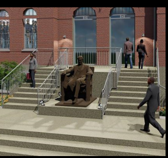
Abraham Lincoln – Emancipation Proclamation 2021