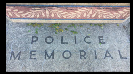
Metropolitan Police Memorial - 1934 to 1941