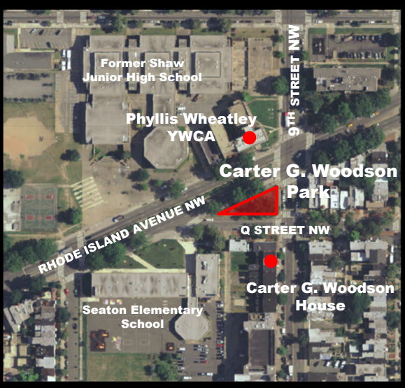
Carter G. Woodson Site Selection

Commemorative Works Committee established to advise the Mayor and DC Council on requests for placing commemorative works on public space in DC.