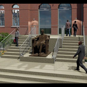
Metro Memorial Park 2014