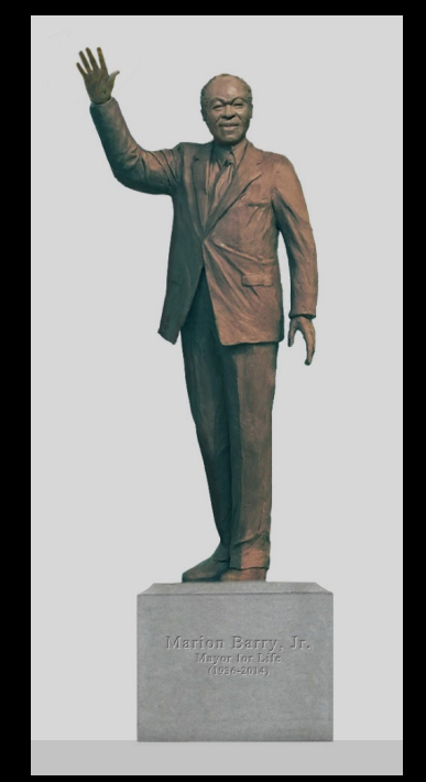
Marion Barry Statue - 2017 Wilson Building Grounds Commemorative Work

"Commemorative work"—any statue, monument, sculpture, streetscape or landscape feature, including a garden or memorial grove, or other structure, which is located on public space and which is designed to perpetuate in a permanent manner the memory of an individual, group, event, or other significant element of international, national, or local culture or history.