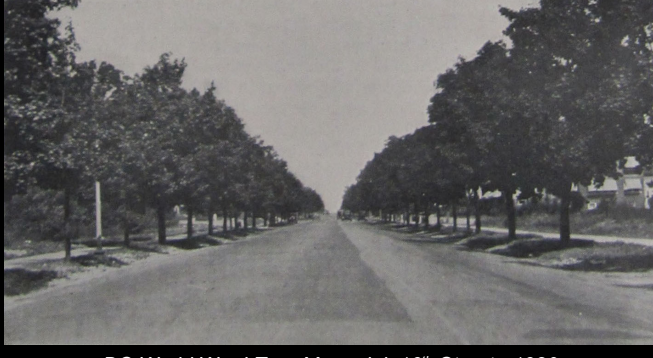
DC World War I Tree Memorial, 16th Street - 1920