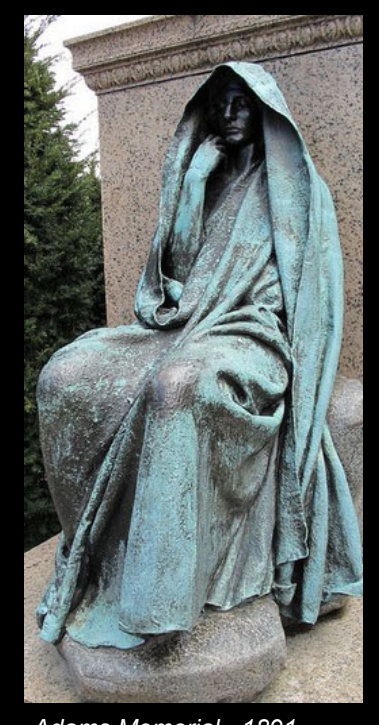
Adams Memorial - 1891 Rock Creek Cemetery Not a Commemorative Work

"Public space"—any public street, alley, circle, bridge, building, park, other public place or property owned by or under the administrative control or jurisdiction of the District of Columbia.